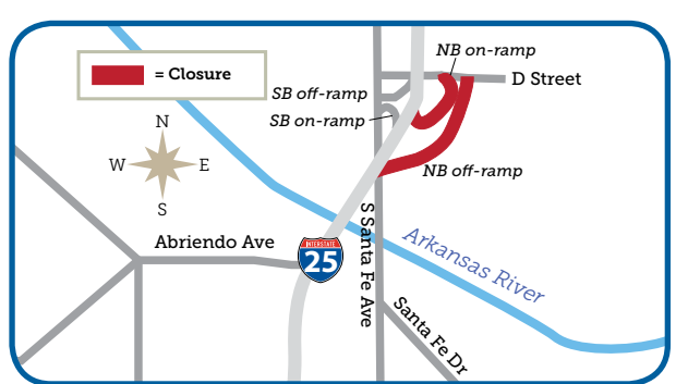
Closure of D Street ramps