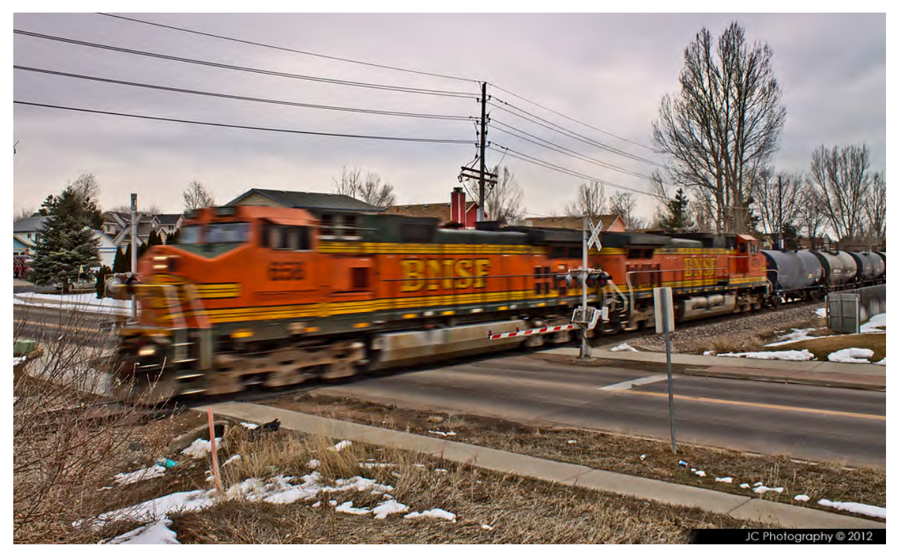
Figure 5: Photo by John Crisanti Photography