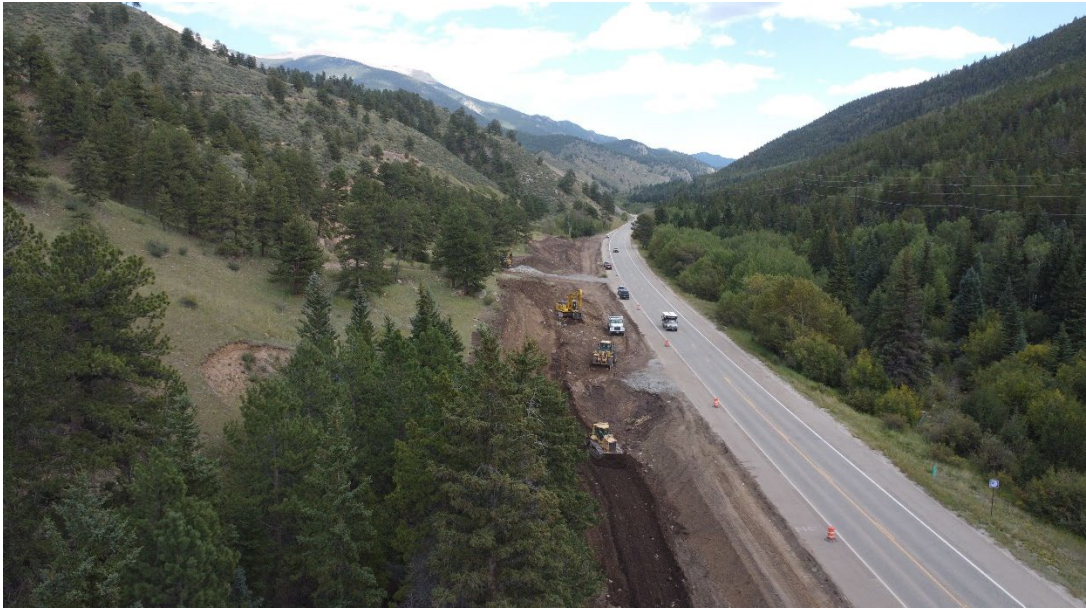
Grading and excavation on the west side of CO 285 near Grant.