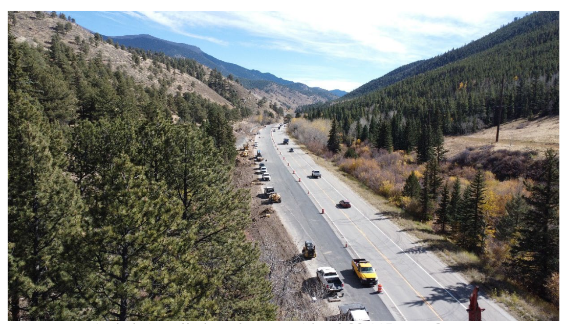
Asphalt installed on the west side of CO 285 near Grant