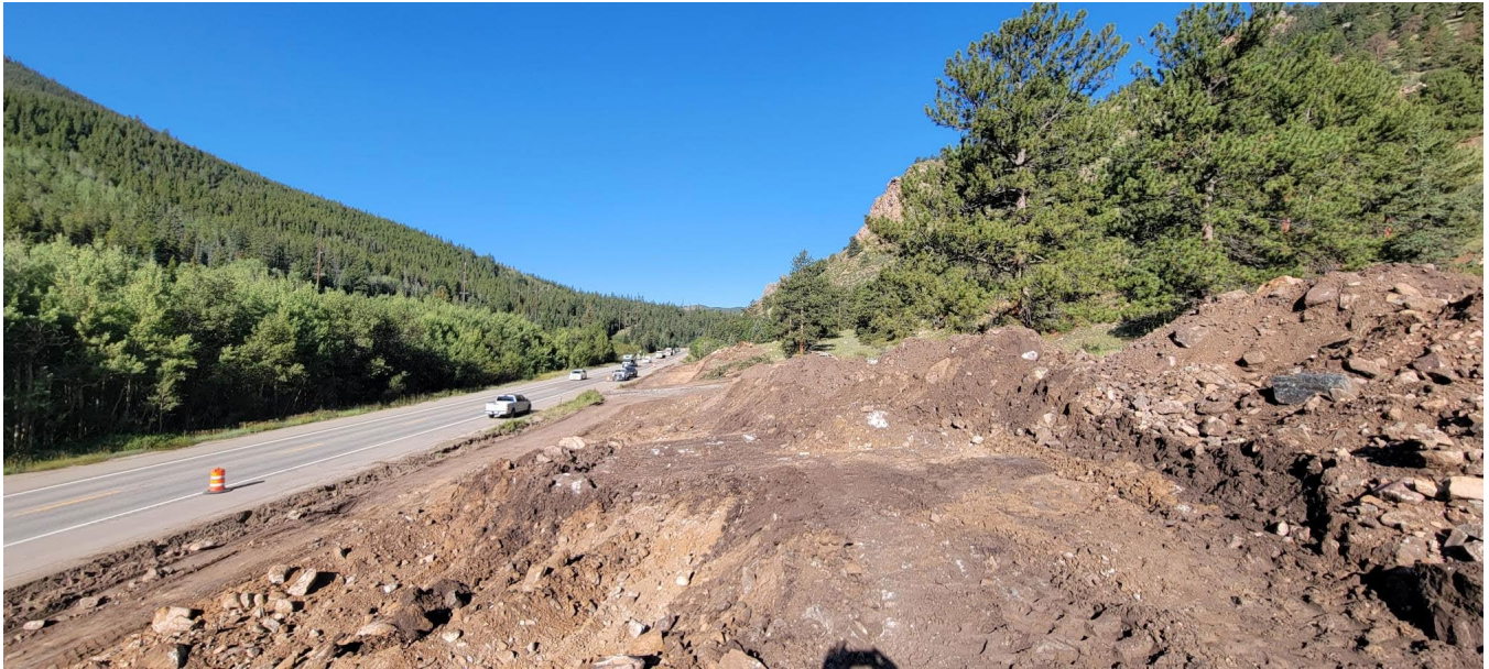
Grading and excavation on the west side of CO 285 near Grant.