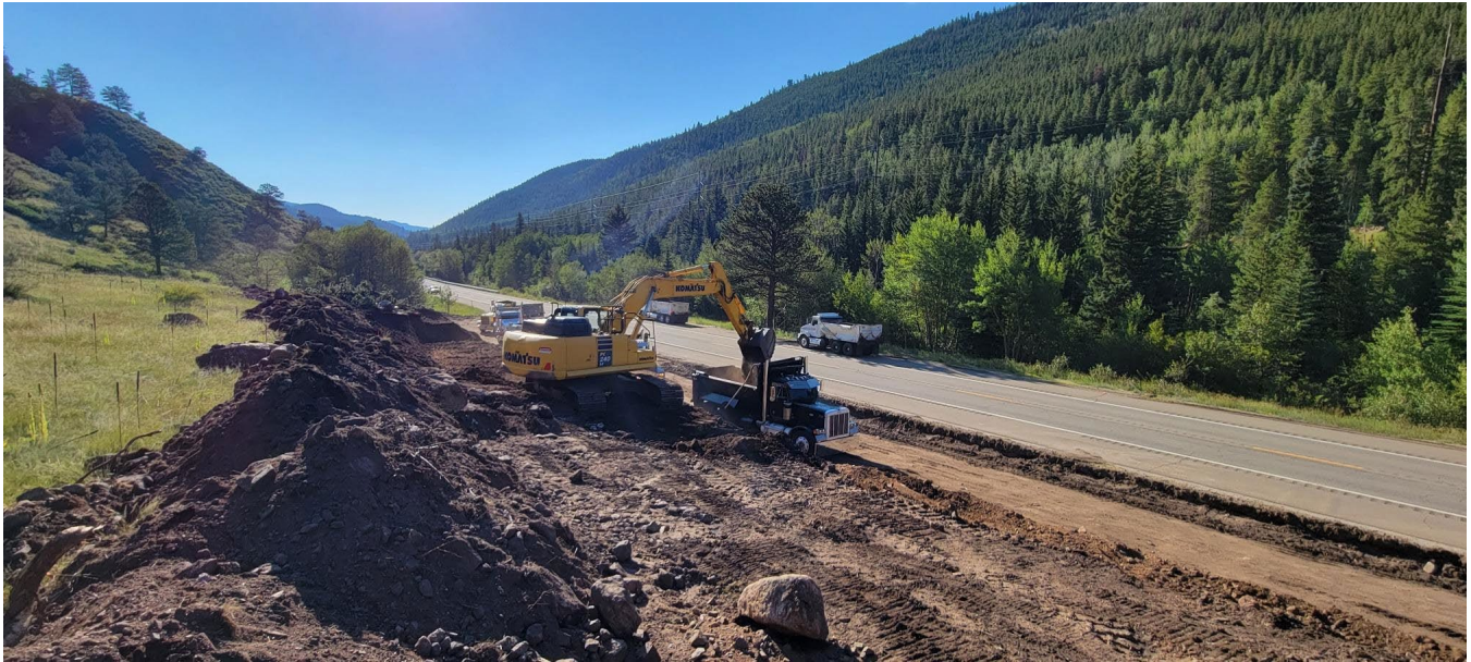
Grading and excavation on the west side of CO 285 near Grant.