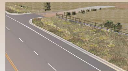
Curb and Gutter