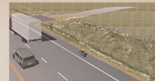
Shoulder / Roadside Ditch