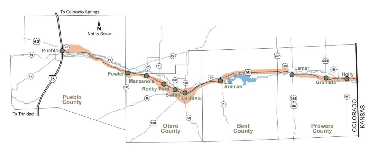
Figure 1-2. U.S. 50 Project Area

The study area is a site 1,000 feet wide centered on the corridor alternatives, beginning on or near the existing U.S. 50 at I-25 in Pueblo, Colorado, and extending to approximately one mile east of Holly, Colorado, in the vicinity of the Colorado-Kansas state line. The study area limits were used to assess potential impacts, as described in Chapter 4. Selection of the project area and study area limits, including the eastern and western termini, was based on the recommended improvements of previous planning studies.