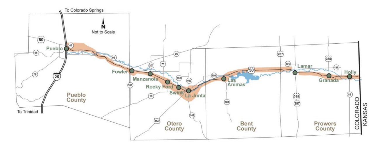
Figure 1-1. U.S. 50 Tier 1 EIS Project Area

The project area does not include the city of Lamar. A separate Environmental Assessment (EA), the U.S. 287 at Lamar Reliever Route Environmental Assessment , includes both U.S. 50 and U.S. Highway 287 (U.S. 287) in its project area, since they share the same alignment. The Finding of No Significant Impact (FONSI) for the project was signed November 10, 2014. The EA/FONSI identified a proposed action that bypasses the city of Lamar to the east. The proposed action of the U.S. 287 at Lamar Reliever Route Environmental Assessment begins at the southern end of U.S. 287 near County Road (CR) C-C and extends nine miles to State Highway (SH) 196. Therefore, alternatives at Lamar are not considered in this U.S. 50 Tier 1 EIS.