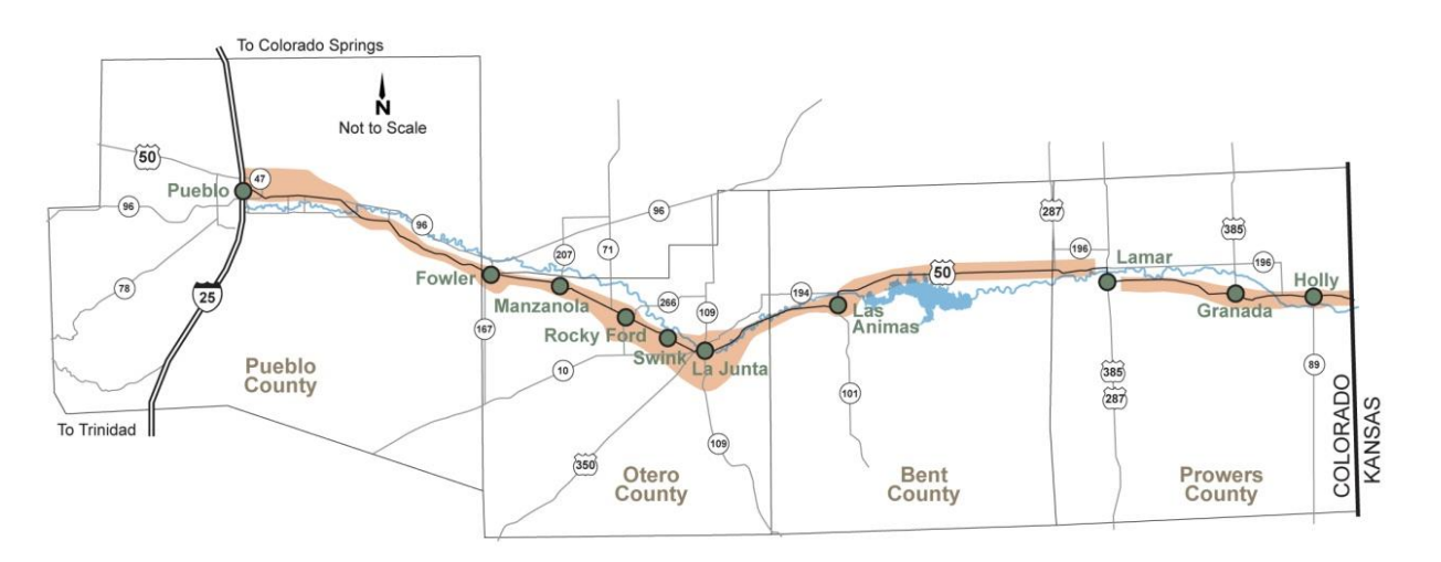
Figure 1-1. U.S. 50 Tier 1 EIS Project Area

The project area does not include the city of Lamar. A separate Environmental Assessment (EA), the U.S. 287 at Lamar Reliever Route Environmental Assessment, includes both U.S. 50 and U.S. Highway 287 (U.S. 287) in its project area, since they share the same alignment. The Finding of No Significant Impact (FONSI) for the project was signed November 10, 2014. The EA/FONSI identified a proposed action that bypasses the city of Lamar to the east. The proposed action of the U.S. 287 at Lamar Reliever Route Environmental Assessment begins at the southern end of U.S. 287 near County Road (CR) C-C and extends nine miles to State Highway (SH) 196. Therefore, alternatives at Lamar are not considered in this U.S. 50 Tier 1 EIS.