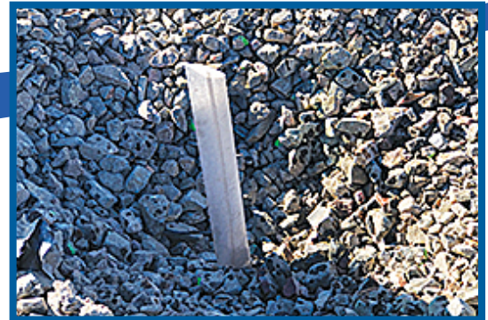
A single wick drain.

southbound Purcell Blvd. with minimal day-to-day impact to motorists.