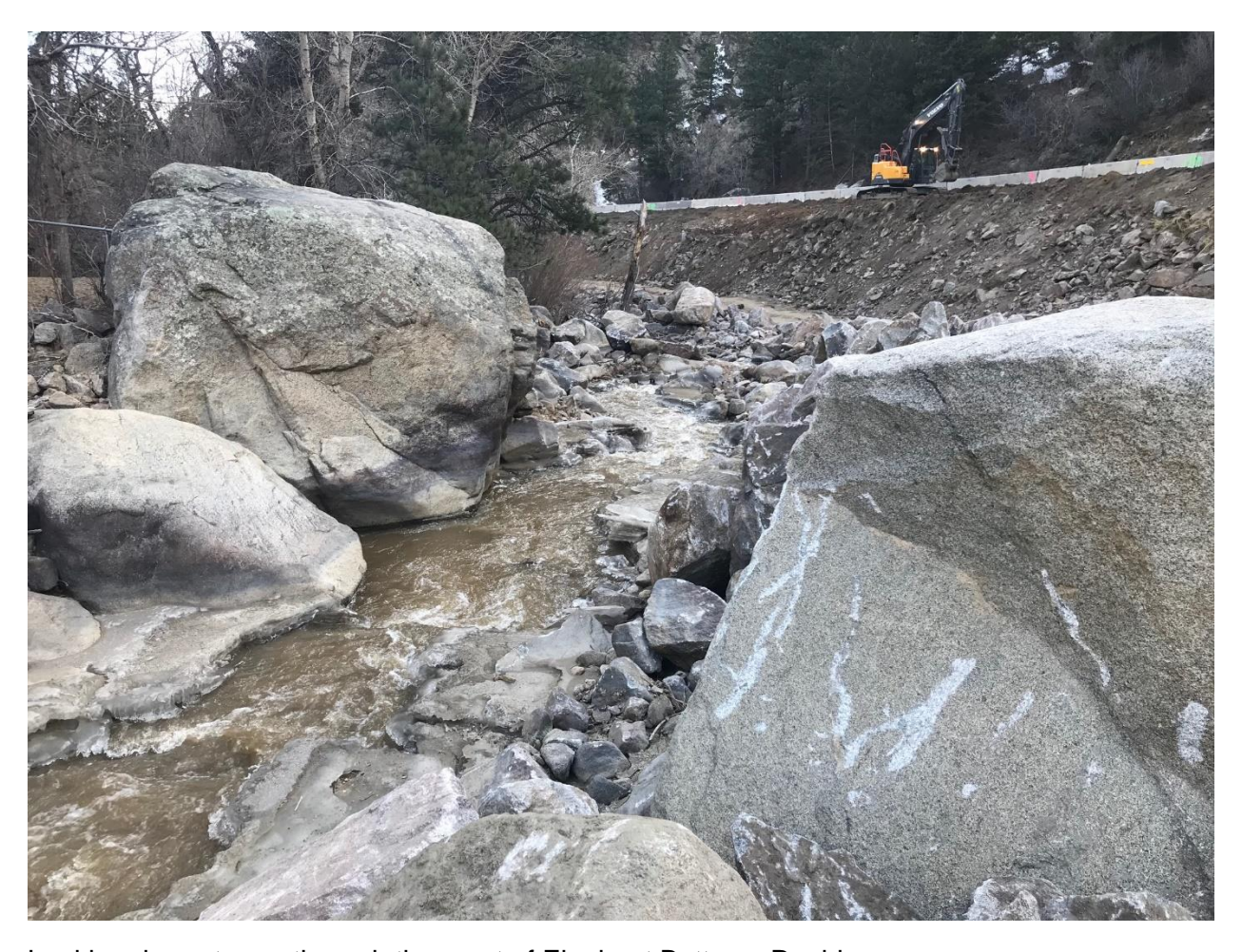
Looking downstream through the meat of Elephant Buttress Rapid.