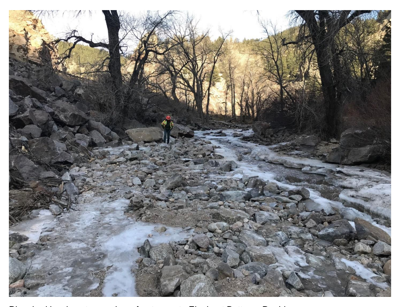
River bed level upstream view of entrance to Elephant Buttress Rapid.