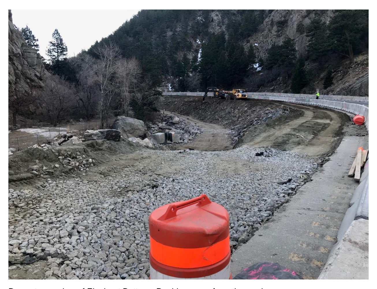
Downstream view of Elephant Buttress Rapid as seen from the road.