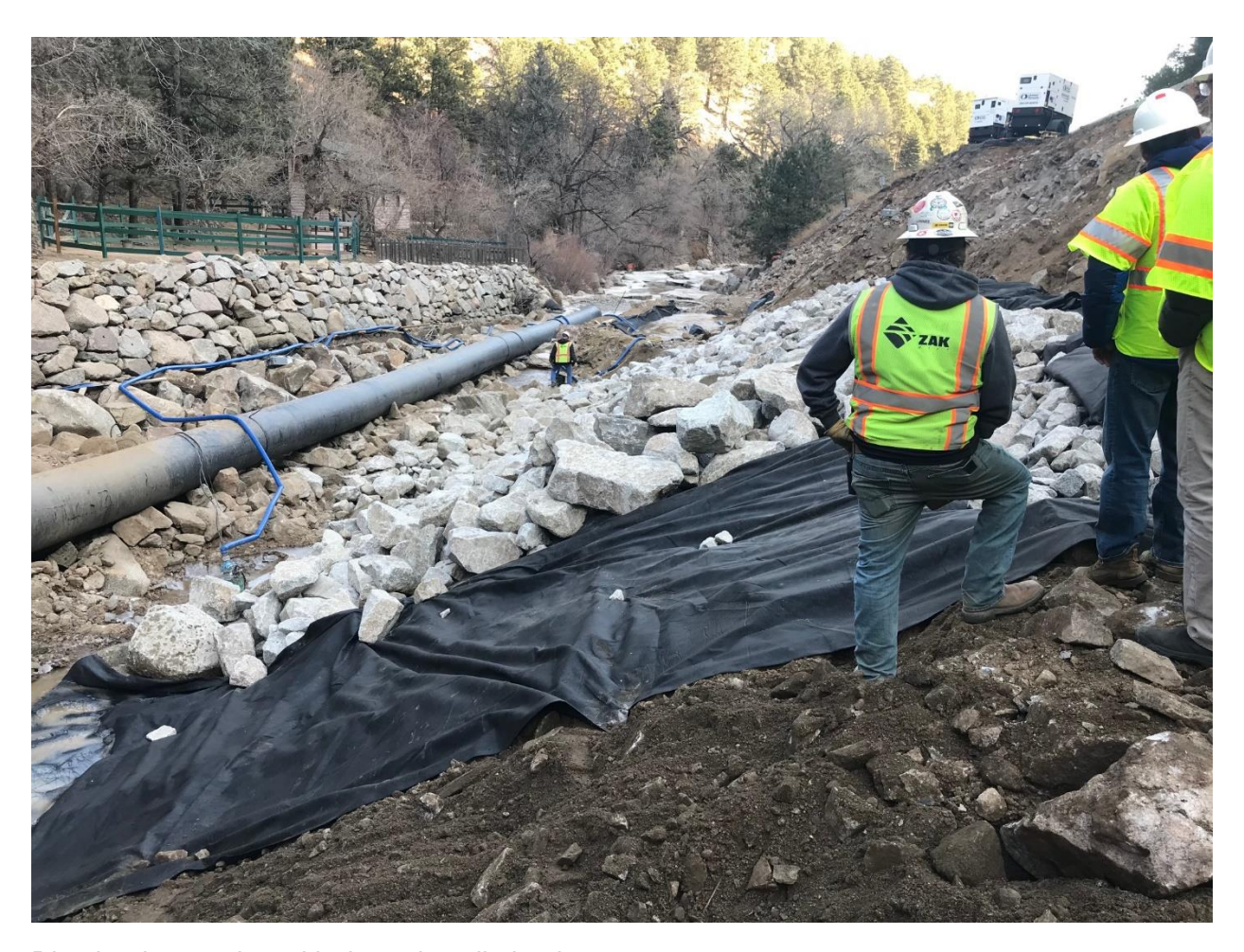
Riverbank armoring with riprap installation in progress.