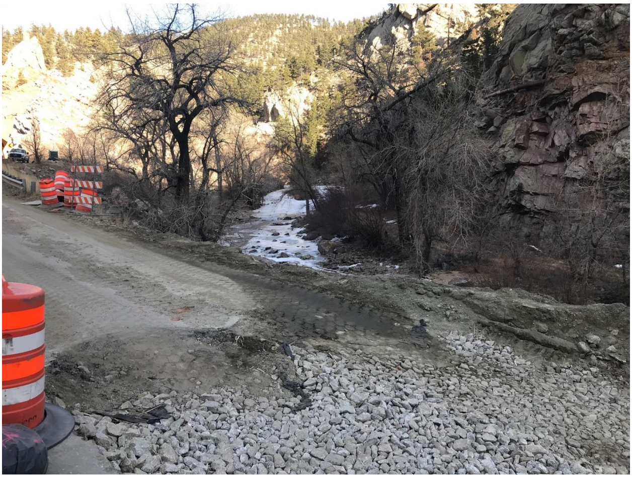
Upstream view of entrance to Elephant Buttress Rapid as seen from the road.