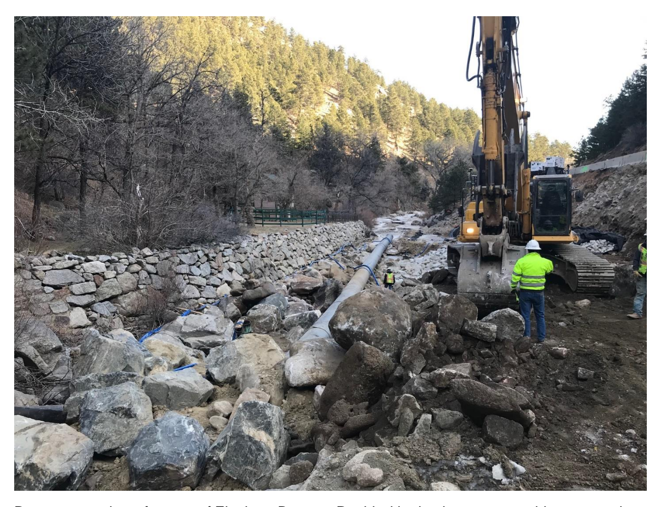
Downstream view of runout of Elephant Buttress Rapid with pipe bypass to enable construction.