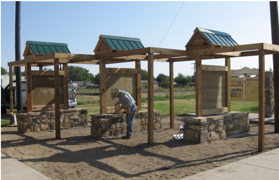
Example amenity site with three interpretive sign panels, shown under construction.

A number of new byway-related features are included in the study's recommendations. These amenities include new scenic pull-offs, restrooms, and visitor centers in La Veta, Cuchara, and Stonewall. Each site will be integrated with the Colorado Front Range Trail and include wayfinding signage, trail information, and in some locations, a bike repair station. A new wayside park with picnic tables, shade shelters and toilets is also recommended along US 160 just west of SH 12.