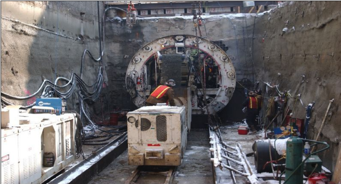
Drainage pipes on south I-25. While the Central 70 system won't be exactly the same, it is being built to handle a 100-year storm event.

Yes. The T-REX project on south I-25 included a comparable lowered section of the interstate between Broadway and University Street between two Denver neighborhoods, Washington Park and Platt Park. Prior to T-REX, this area had significant historical flooding issues. The T-REX project drainage system consisted of pipes and an outfall to the South Platte River capable of handling a 100-year storm event. Since it was completed in 2006, there have been no significant flooding events on the interstate.