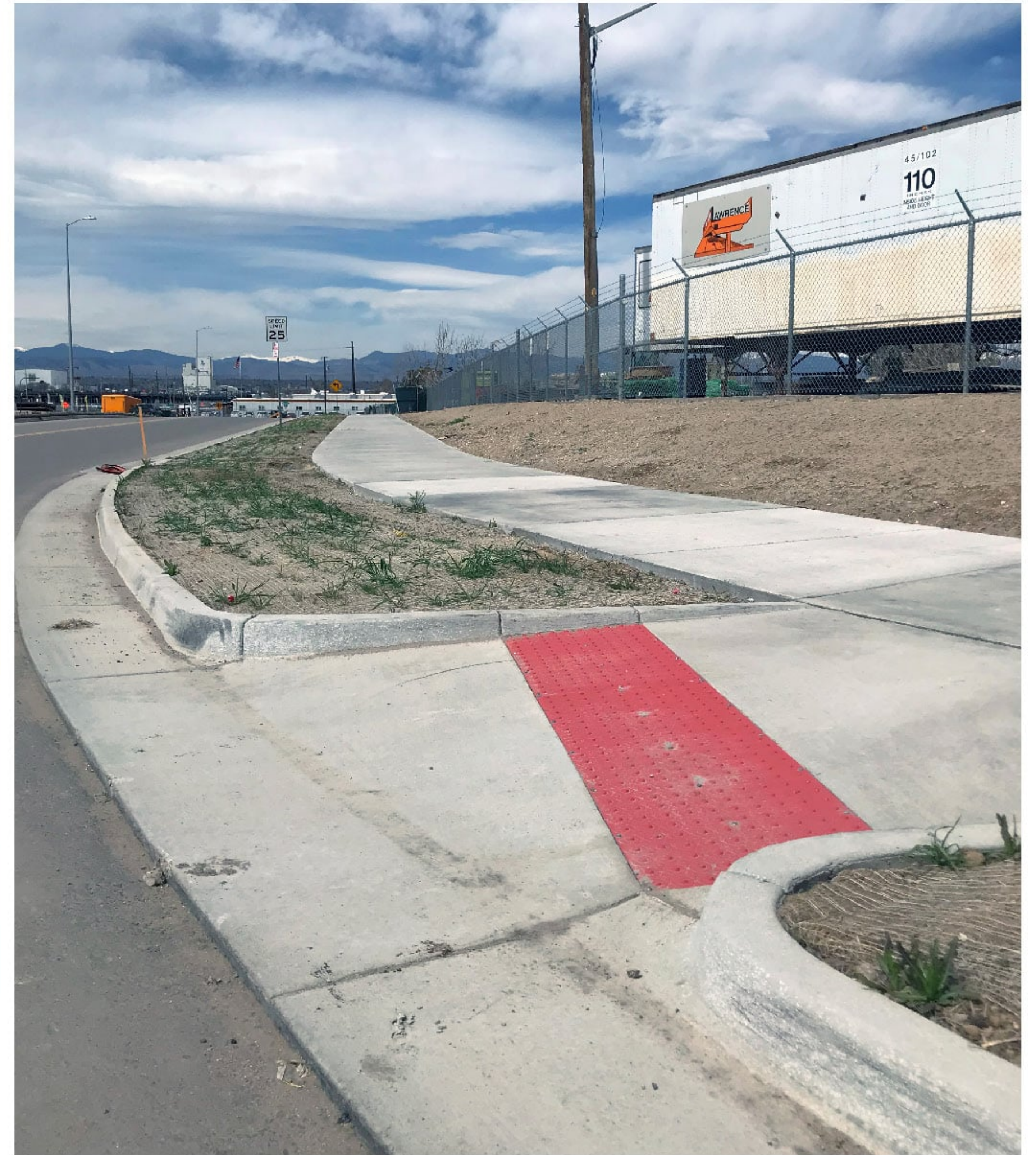
Newly installed sidewalks along 46th Avenue in 2021.