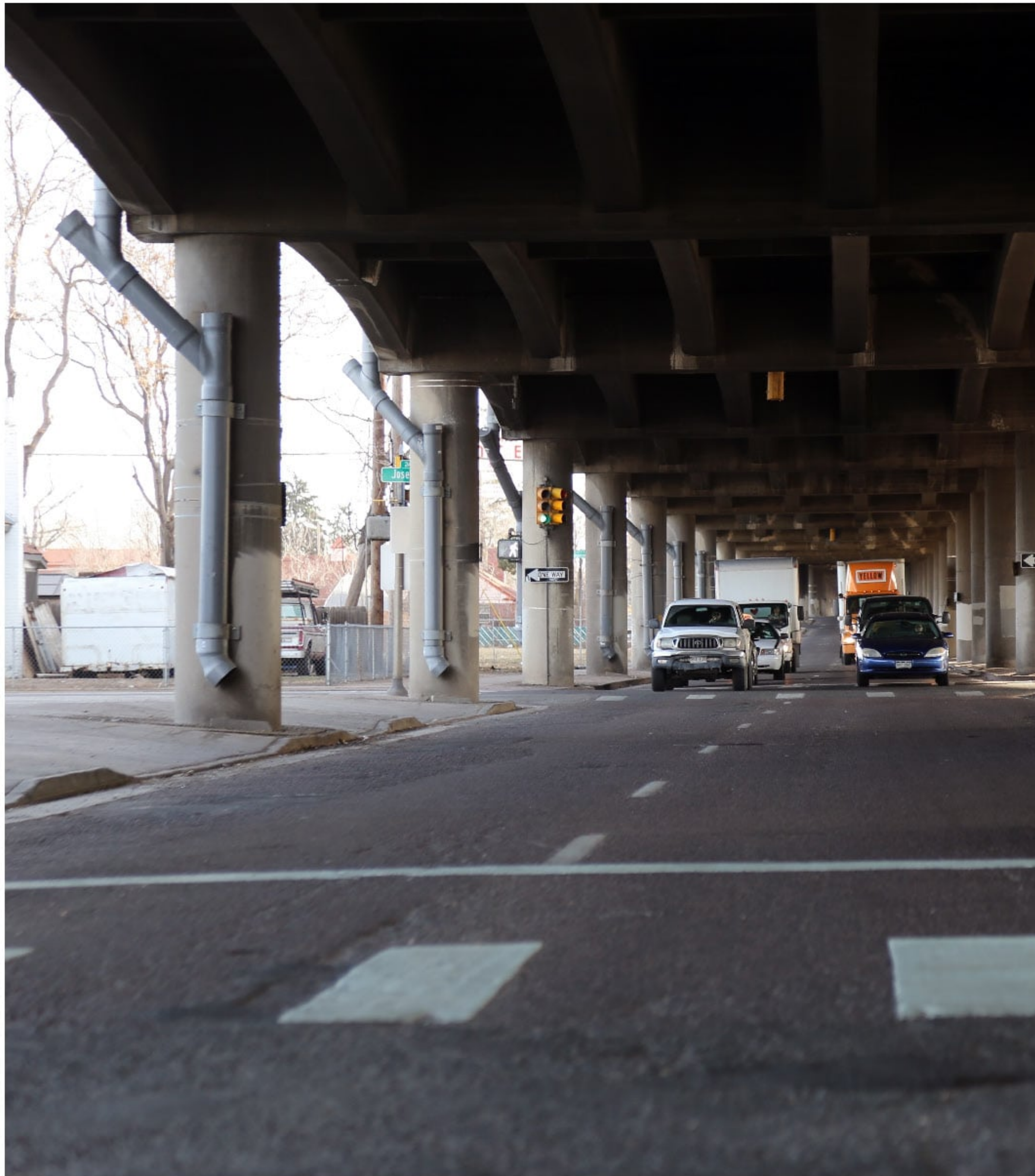
46th Avenue under the viaduct in 2015, dark with no sidewalks available.