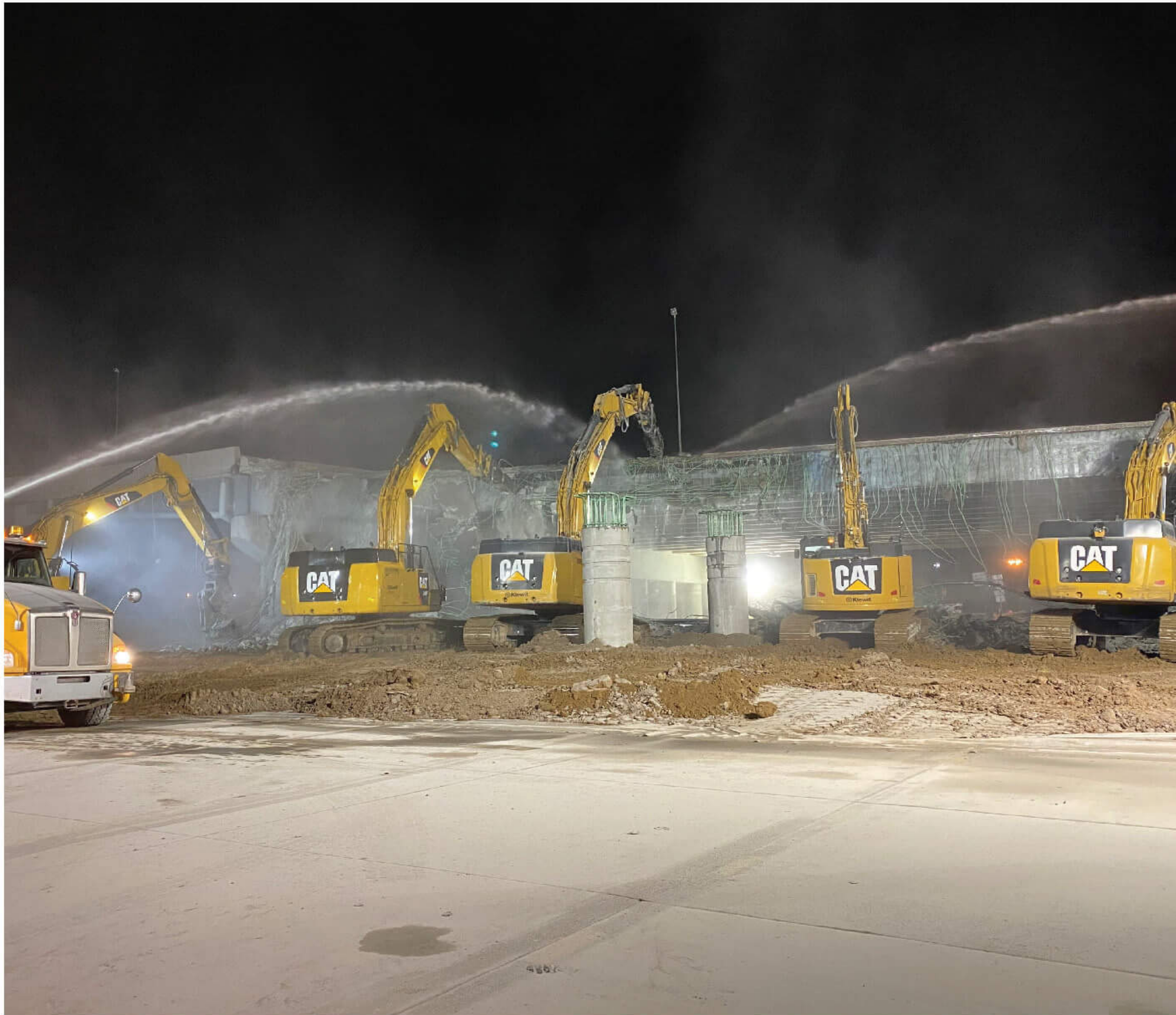
Water trucks at work.