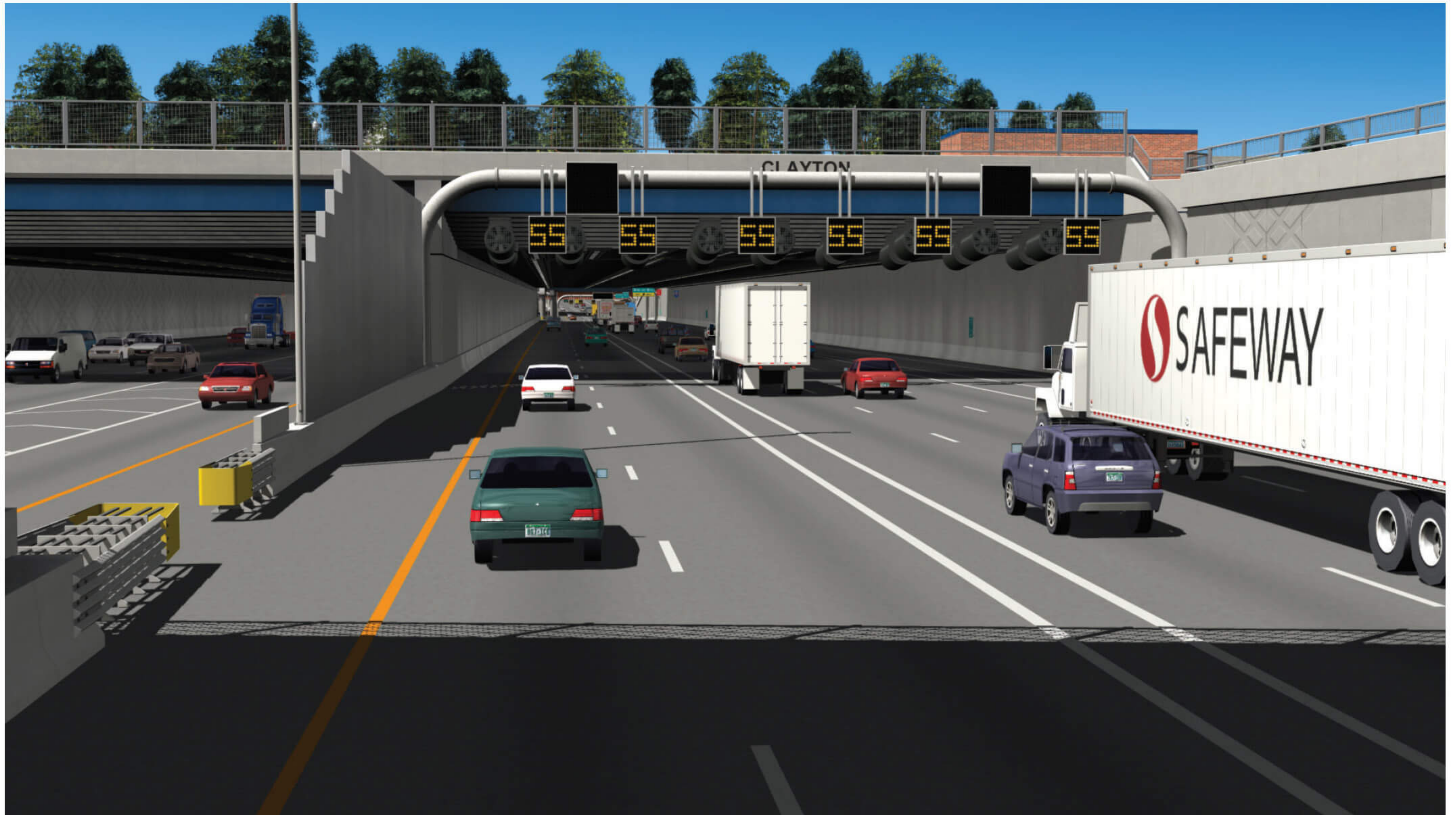
Future Express Lane signage along I-70, near Clayton Street.