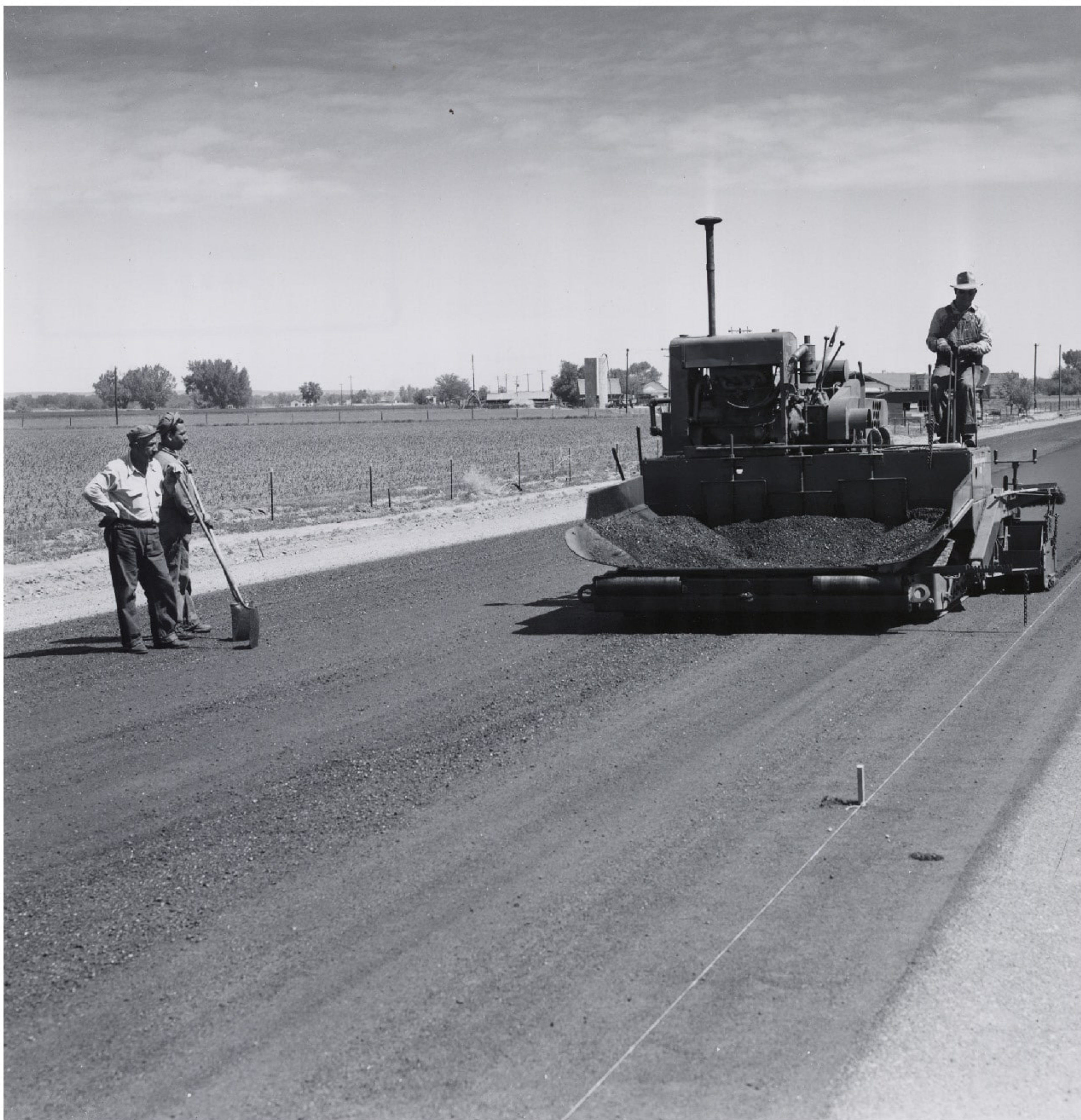
Highway construction, 1950. History Colorado. Accession ID #90.290.1965