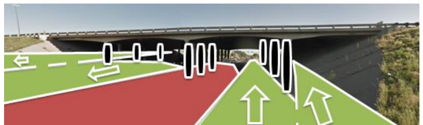
Street View: Anticipated Temporary Traffic Configuration

Please note all lanes will remain open during peak travel hours of 5 - 8:30 a.m. and 3:30 - 7 p.m. Pedestrian access will be maintained and shift intermittently from the east and west side of the street as work progresses.