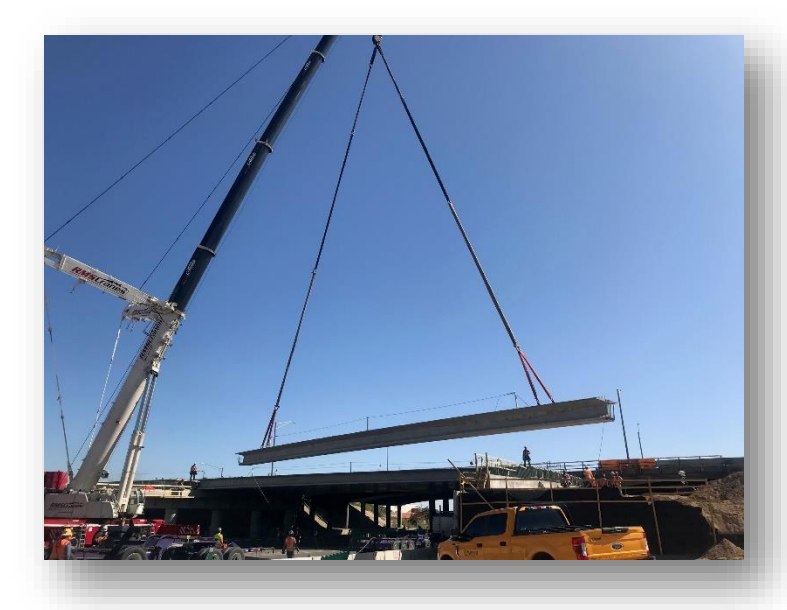
Girder set at Colorado Boulevard Bridge