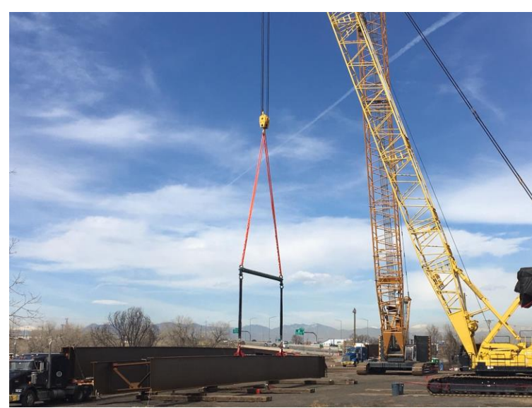
I-270 flyover girders getting ready to be set