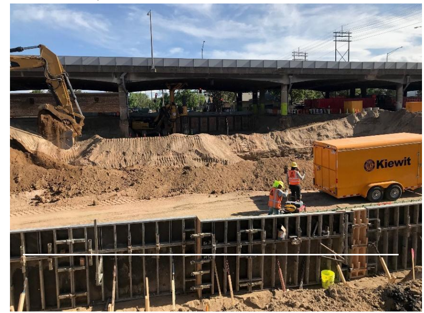
Looking south at the Columbine Street bridge abutment