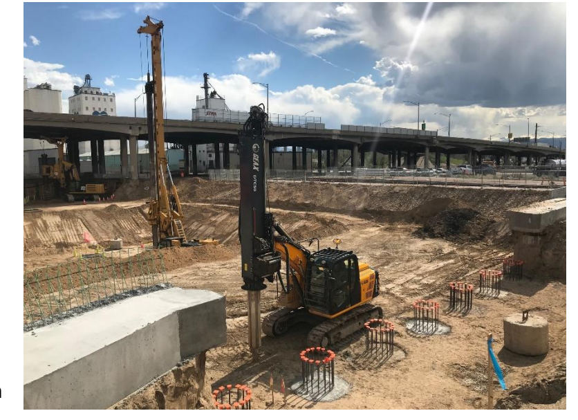
Construction of Monroe Street Bridge