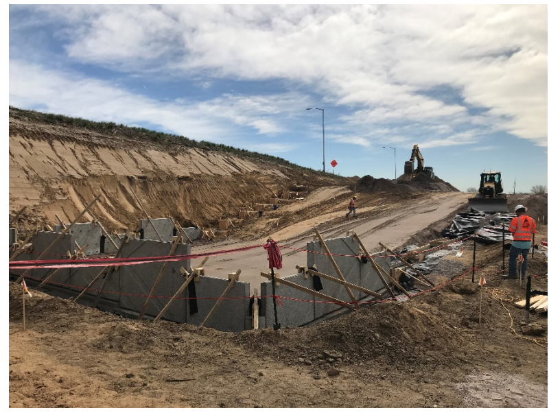
Construction of the bridge abutment for the I-270 flyover