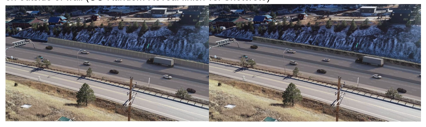
Wall 3- Structural looking retaining wall, handling hydraulics of snow/rain runoff in ditch on outside of wall (CO Random Reveal finish vs. Shotcrete)