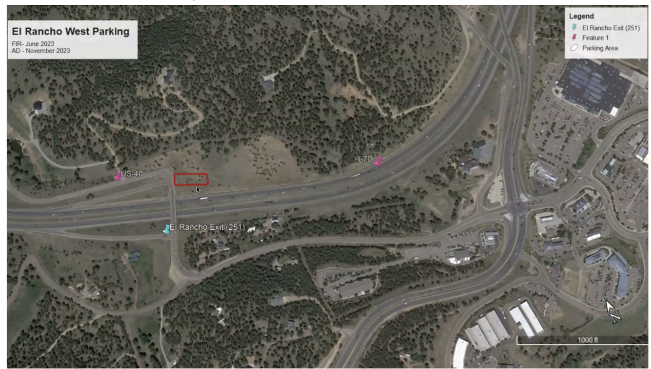
( Pictured above: Location of El Rancho Parking Lot at Exit 251, Pictured below: Initial design for the El Rancho Parking Lot)