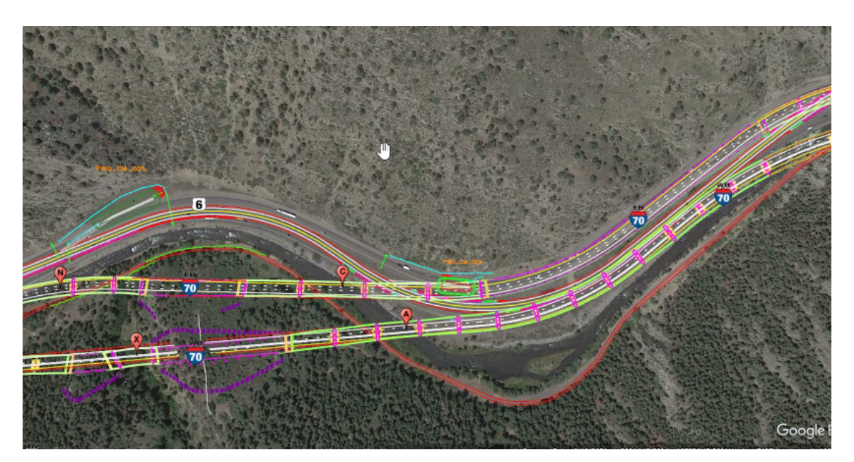
Ponds 3 & 4