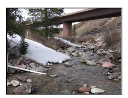
West Tenmile Creek monitoring station above Copper Mountain

The Corridor also includes two reservoirs along the way (Lake Dillon and Georgetown Reservoir). Clear Creek County proposes several future reservoirs for water storage along the I-70 highway