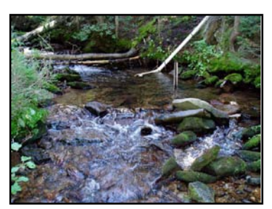
A water quality evaluation study

These regulations protect surface and groundwater quality for drinking water, recreation, agriculture, and aquatic life. Water quality is protected to minimize siltation of lakes and reservoirs and to minimize the loss of wetlands that help filter the water system in natural ways.