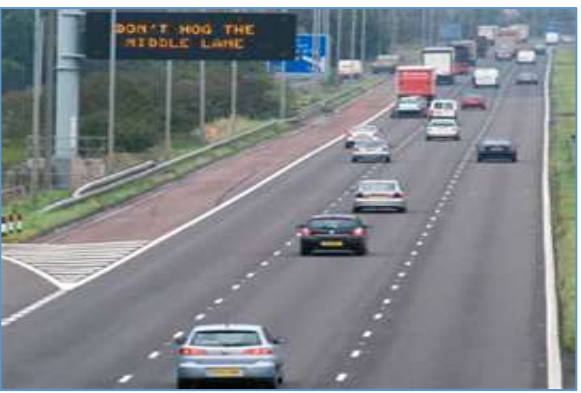
Peak Period Shoulder Lane along left side of highway

New this summer! When heavy travel is anticipated during key weekends, CDOT personnel will be identified and ready to assist in clearing incidents not involving injuries to help highway performance recovery.