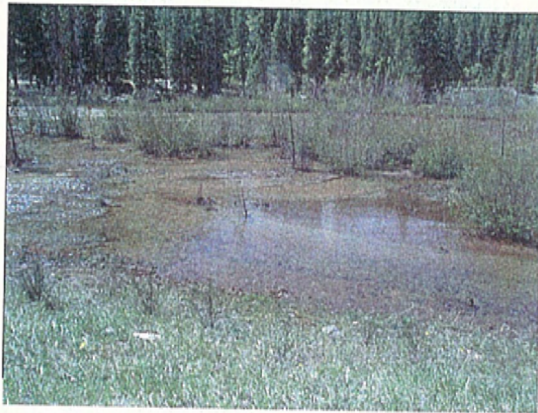
1 Sedimentation/Wetland Reduction. Clear Creek near Bakerville.