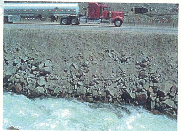
4 Sedimentation. Clear Creek near Brownville Slide area upstream from Silver Plume.