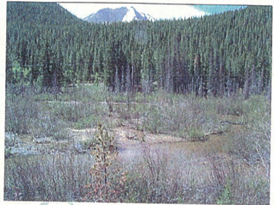
2 Sedimentation/Wetland Reduction. Clear Creek near Bakerville.