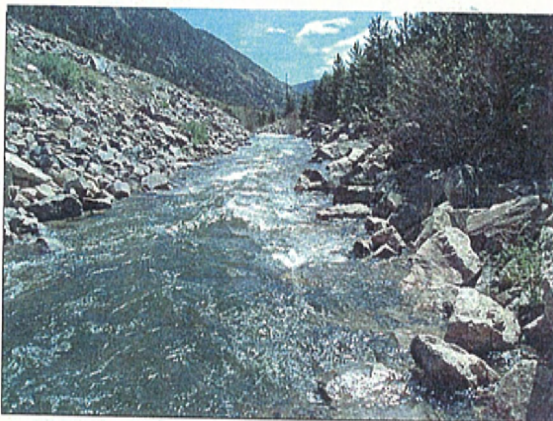
3 Channelization. Clear Creek near upstream from Silver Plume.