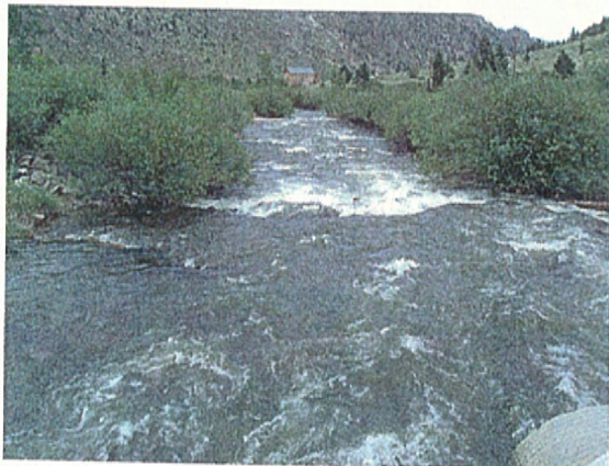
5 Riparian Habitat. Clear Creek downstream from U.S. 6 Crossing