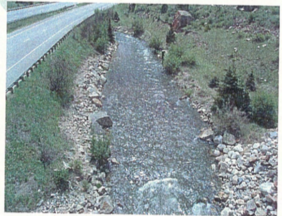
4 Channelization. Clear Creek upstream from West Fork Clear Creek