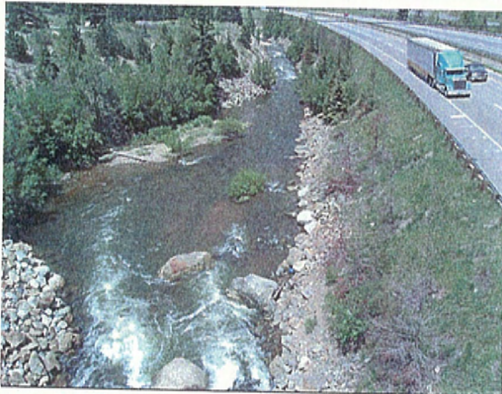
3 Channelization/Sedimentation. Clear Creek upstream from Empire Junction.