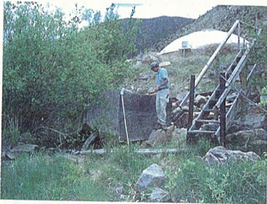
1 Treatment Plant Discharge. Georgetown Waste Water Treatment Plant.