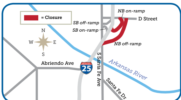
Closure of D Street ramps

If you have questions about the project, contact the Public Information Team. You will receive a response within 24 business hours.