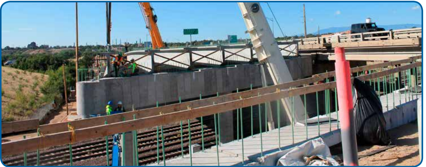
Girder settings on the eastside of I-25 over the Union Pacific Railroad (UPRR)