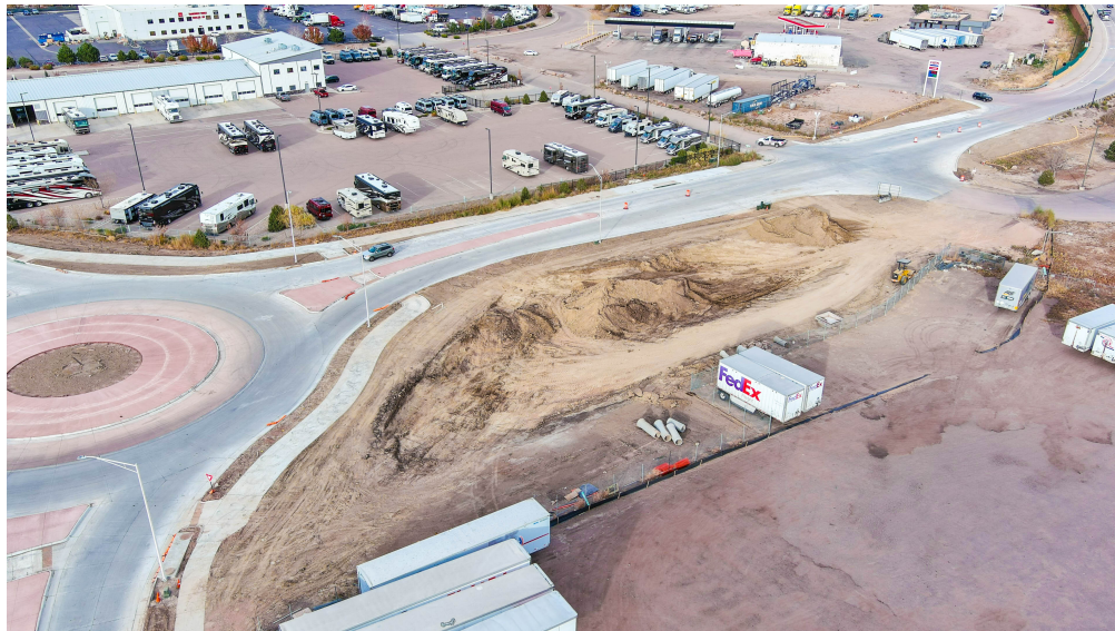
Drainage pond construction near newly constructed roundabout at Charter Oak Ranch Road