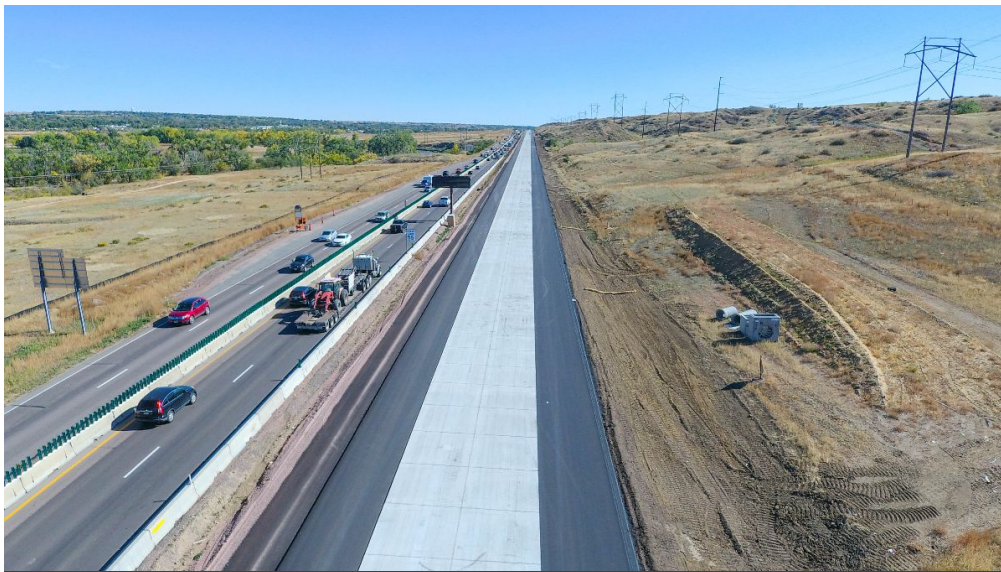
Southbound I-25 paving between Academy Boulevard and CO 16.