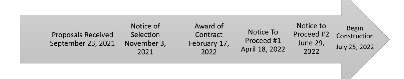
Figure 1: Project timeline showing major project milestones. The timeline starts at proposals received on September 23, 2021 and currently extends to the beginning of construction on July 25, 2022.

Preconstruction through construction start