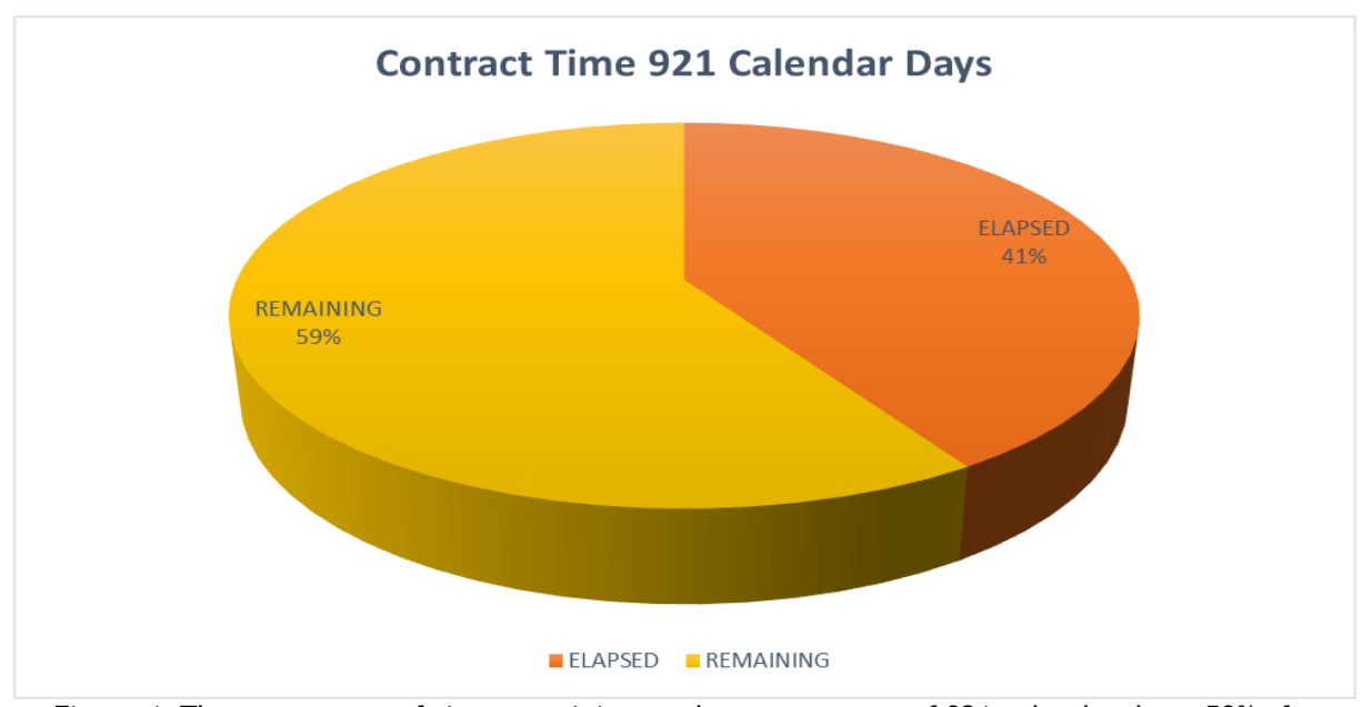
Figure 4: The percentage of time remaining on the contract out of 921 calendar days. 59% of contract time remains on the project as of April 2023.