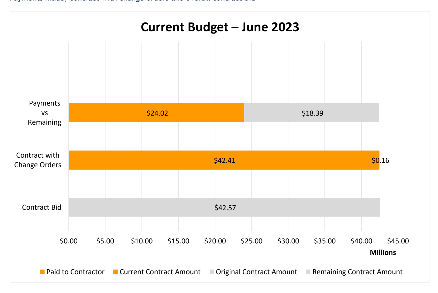
Figure 3: Current budget as of June 2023. The contract was bid at $42.57 million with change orders. $24.02 million has been paid to date.