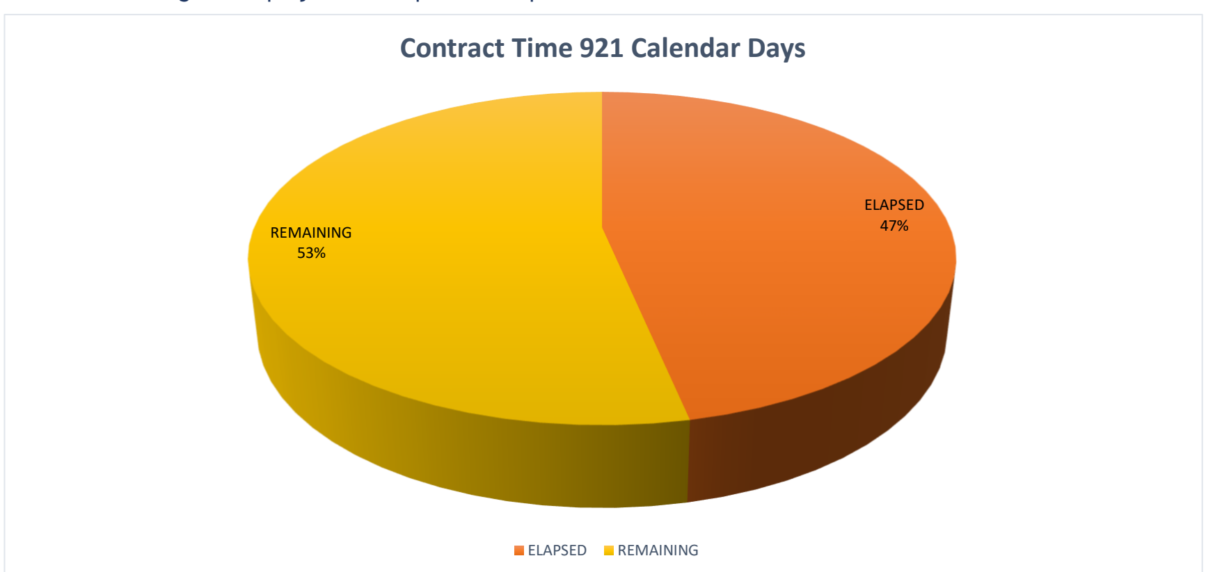
Figure 4: The percentage of time remaining on the contract out of 921 calendar days. 53% of contract time remains on the project as of June 2023.