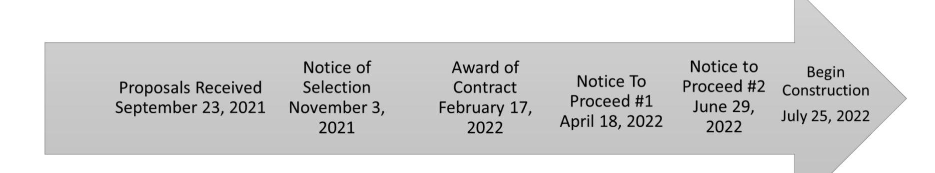
Figure 1: Project timeline showing major project milestones. The timeline starts at proposals received on September 23, 2021 and currently extends to the beginning of construction on July 25, 2022.

Project Timeline - Figure 1 Preconstruction through construction start