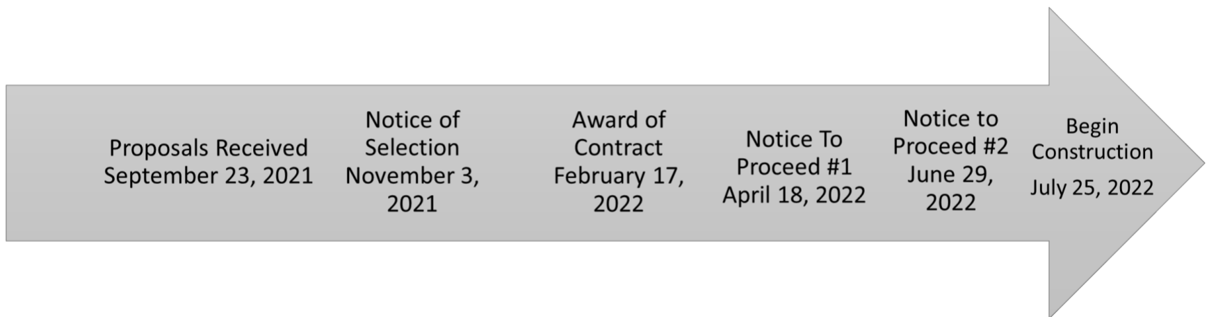
Figure 1: Project timeline showing major project milestones. The timeline starts at proposals received on September 23, 2021 and currently extends to the beginning of construction on July 25, 2022.