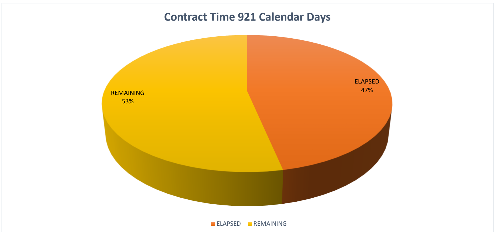
Figure 4: The percentage of time remaining on the contract out of 921 calendar days. 53% of contract time remains on the project as of June 2023.

Percent remaining on the project versus percent elapsed