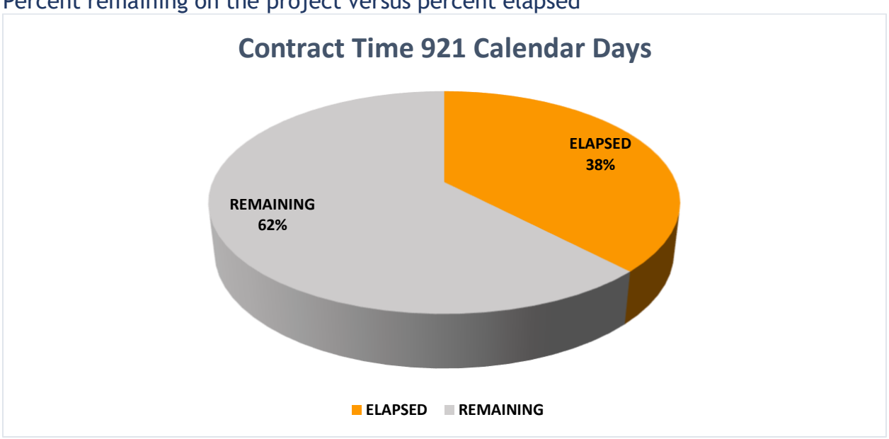
Figure 4: The percentage of time remaining on the contract out of 921 calendar days. 62% of contract time remains on the project as of March 2023.

Percent remaining on the project versus percent elapsed