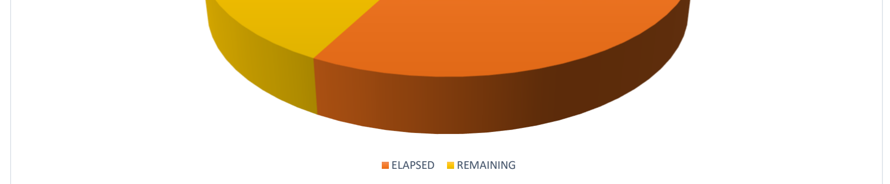
Figure 4: The percentage of time remaining on the contract out of 921 calendar days. 42% of contract time remains on the project as of September 2023.