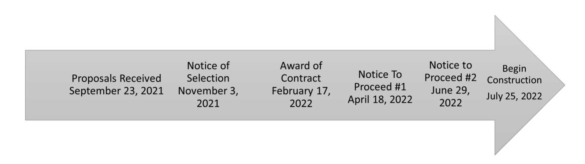
Figure 1: Project timeline showing major project milestones. The timeline starts at proposals received on September 23, 2021 and currently extends to the beginning of construction on July 25, 2022.

Project Timeline - Figure 1 Preconstruction through construction start