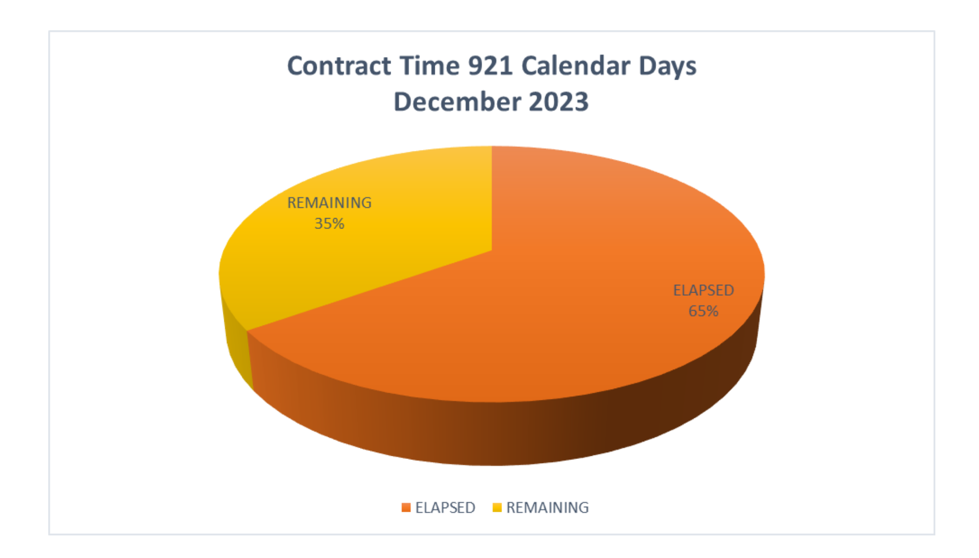
Figure 4: The percentage of time remaining on the contract out of 921 calendar days. 35% of contract time remains on the project as of December 2023.

Contract Time 921 Calendar Days - Figure 4 Percent remaining on the project versus percent elapsed