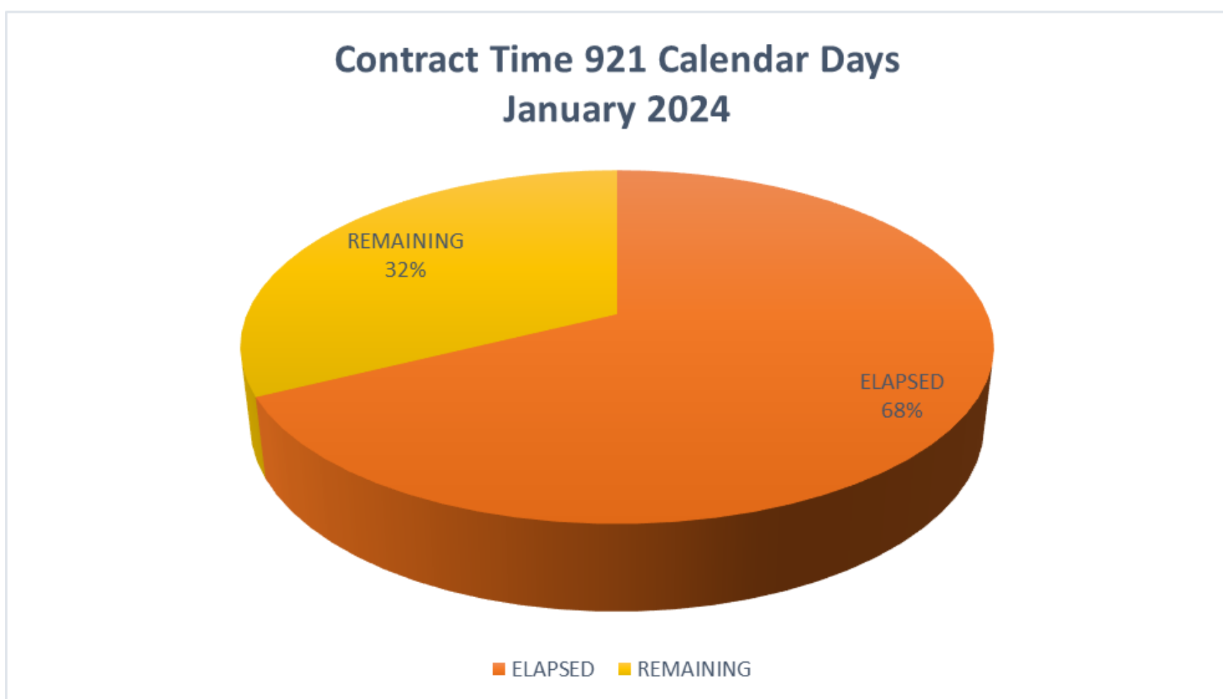
Figure 4: The percentage of time remaining on the contract out of 921 calendar days. 32% of contract time remains on the project as of January 2024.