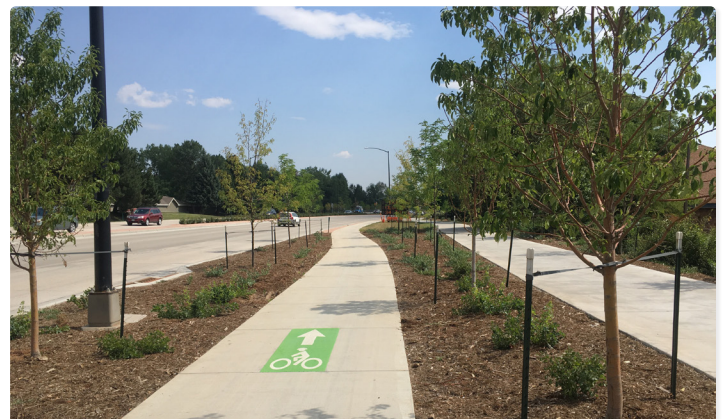
One-way Protected Bike Lane within sections of Boulder