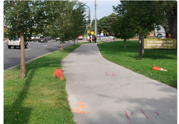
Separated Multi-Use Path - ultimate recommendation for entire corridor

The recommendation for the entire corridor is an off-street multi-use path in both directions. A bikeable shoulder has also been identified as a near-term (before the ultimate facility is implemented) or supplemental recommendation in some areas. The details of the ultimate bicycle facility will likely be modified as specific locations move into final design.