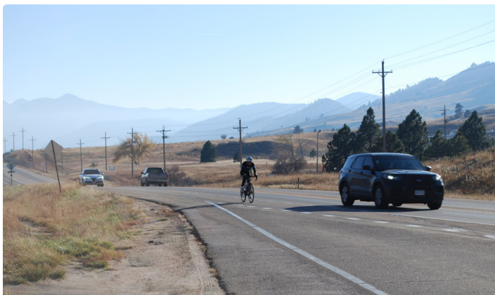
Bikeable Shoulder (near-term or supplemental) buffered when possible

Since the ultimate recommendation may not always be possible to construct given design constraints such as limited right-of-way (ROW), near-term and/or supplemental recommendations have been made. Some recommendations are: a bikeable shoulder (in rural areas), one-way protected bike lane (in sections of Boulder) or a bicycle boulevard (for a small stretch in Lafayette)