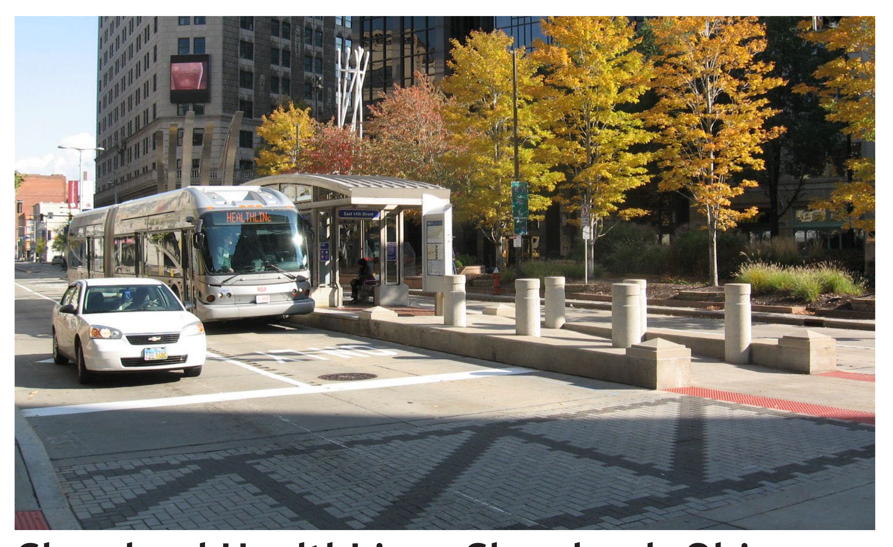
Cleveland HealthLine, Cleveland, Ohio