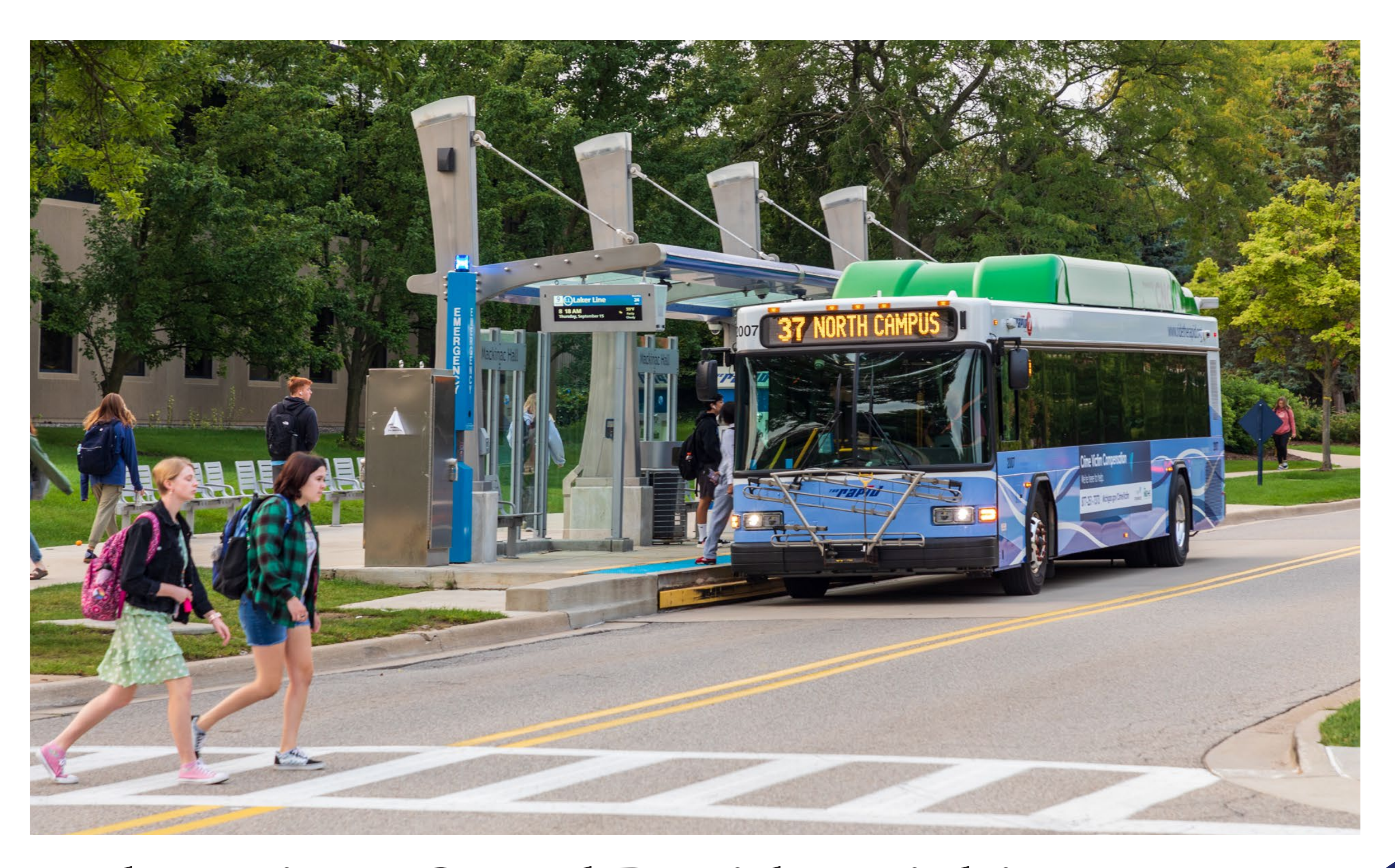
Laker Line, Grand Rapids, Michigan