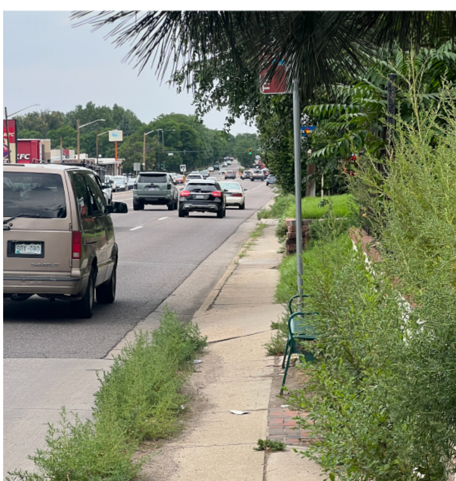
Colorado and 26th Ave.