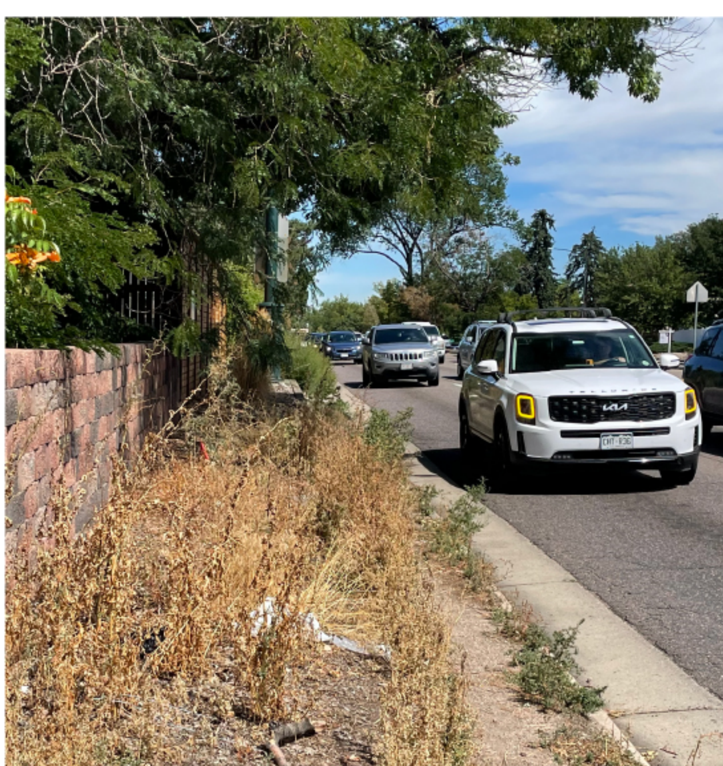
Colorado and 3rd Ave.