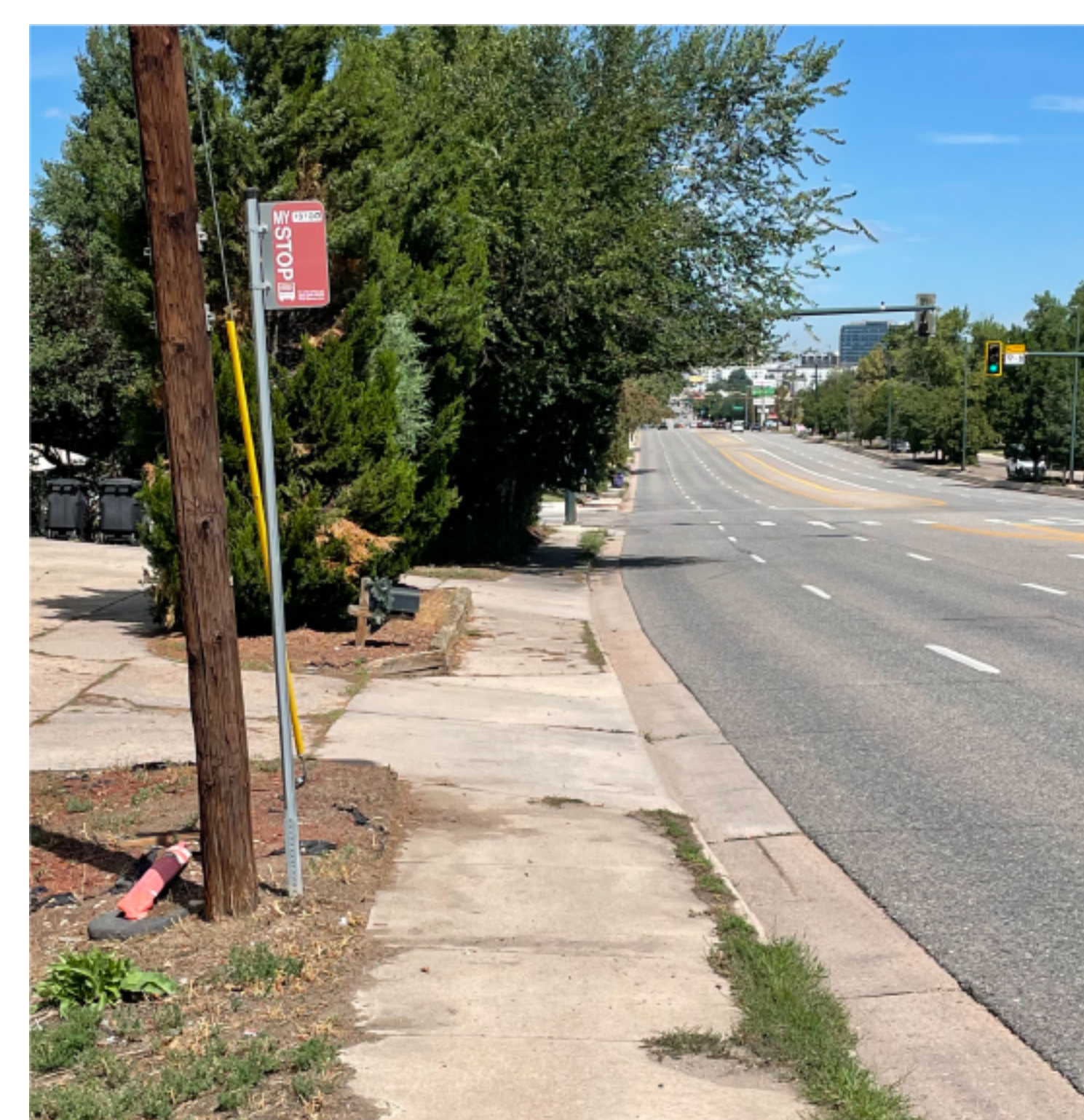
Colorado and Dartmouth