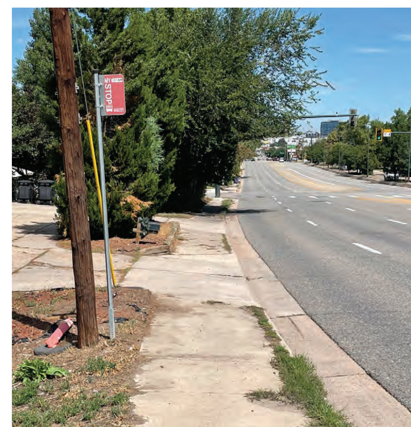
Colorado and Dartmouth