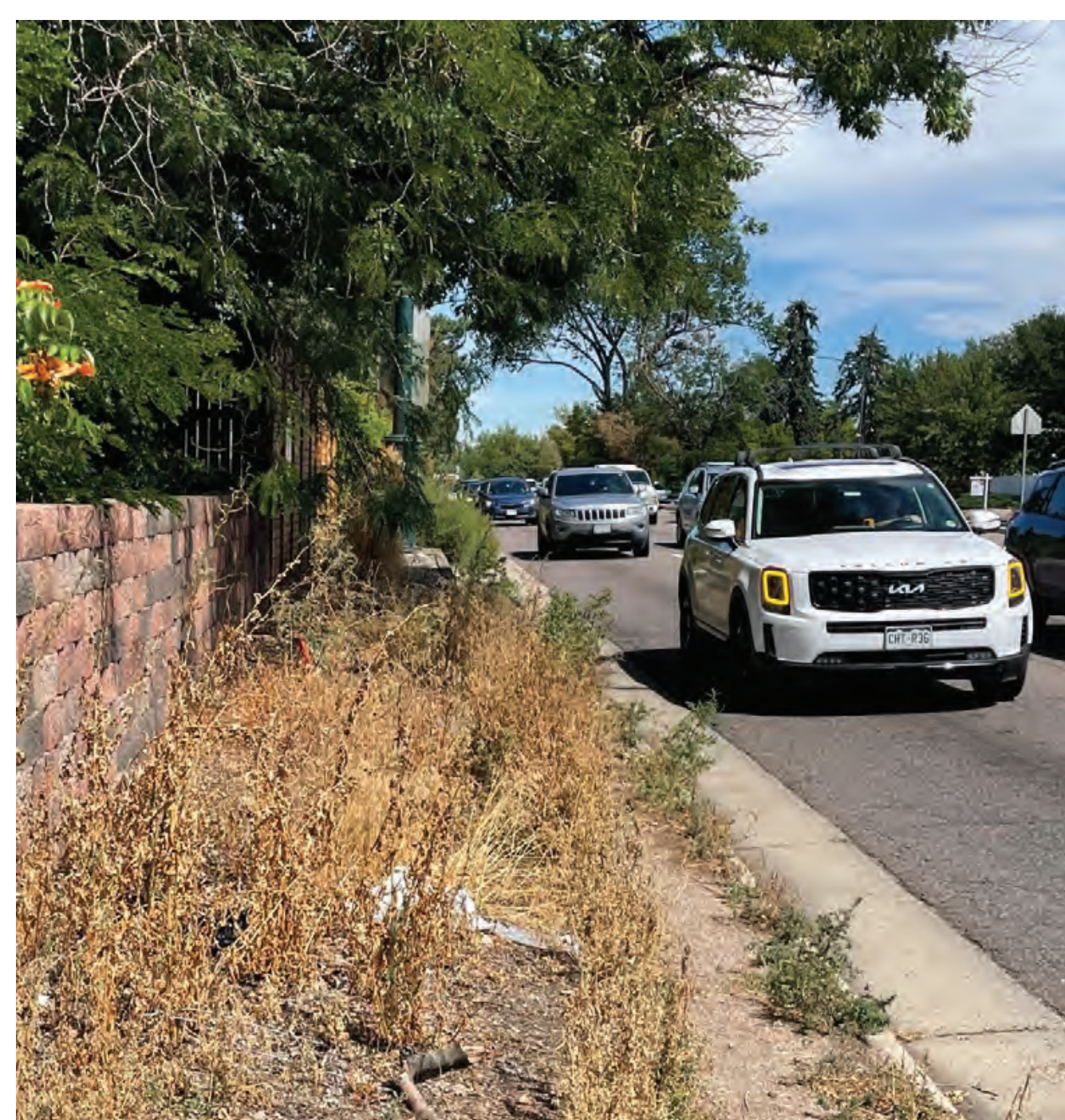
Colorado and 3rd Ave.