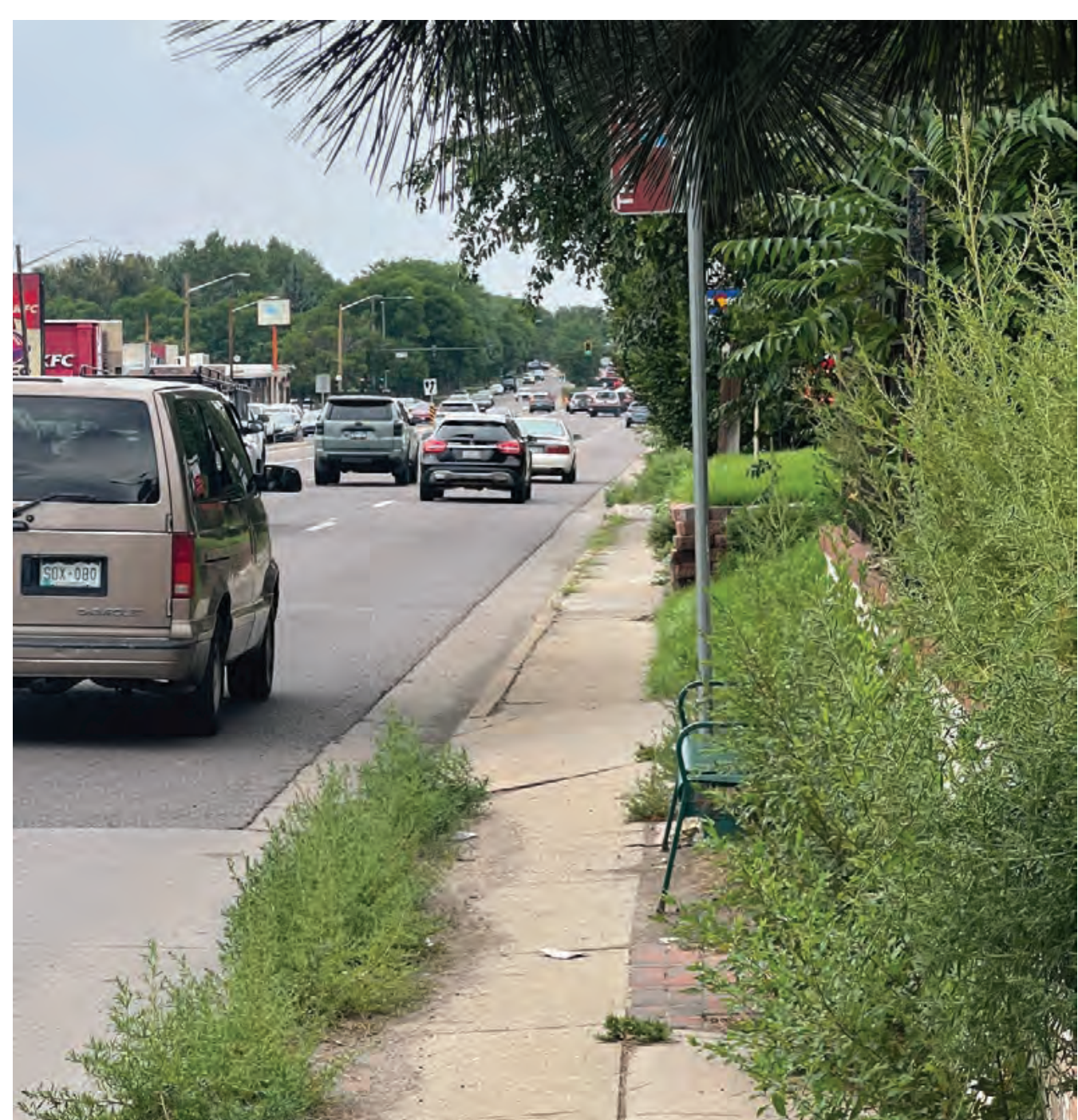
Colorado and 26th Ave.