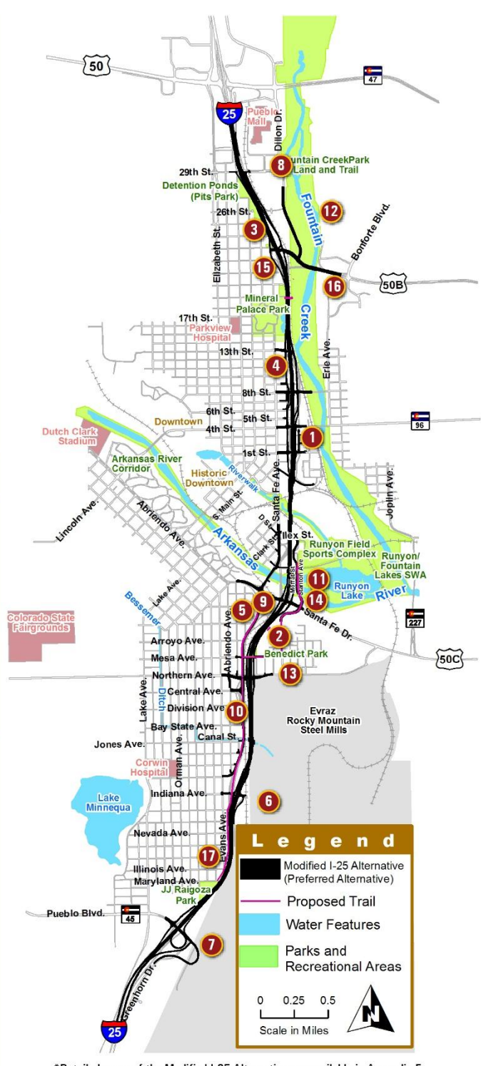
*Detailed maps of the Modified I-25 Alternative are available in Appendix E of the FEIS.

Accommodates Circulator Bus System Transportation Systems Management (TSM) Travel Demand Management (TDM) (By Others) Intelligent Transportation Systems (ITS)