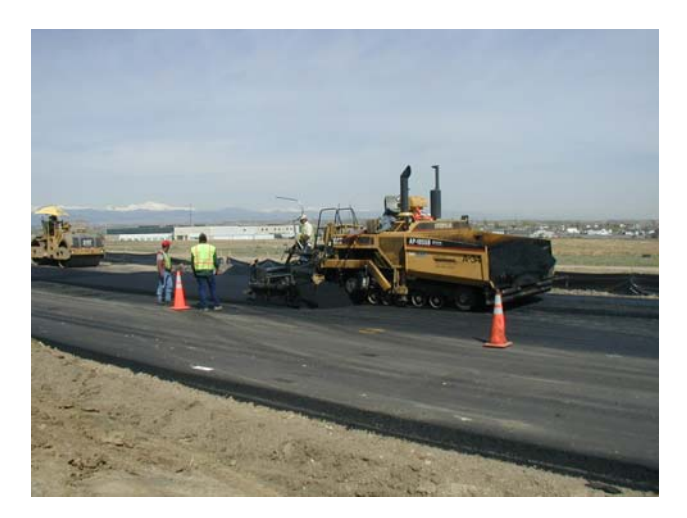
Figure 4.20-1 Asphalt Paving

Paving is accomplished with track-mounted paving machines. The machines lay down either asphalt or concrete in layers and smooth the pavement surface in continual operations (see Figure 4.20-1 ). Large trucks or mixers are used to haul the concrete or asphalt material from the plant to the site. Since this project is located in the Denver metro area where there are multiple sources for asphalt and concrete a project-specific plant site may not be identified. Paving material haulage can create additional traffic and noise impacts. As with the earthen fill material, the paving materials should come from sources identified by the contractor. These impacts should be addressed during the contractor's permit process as outlined in the CDOT Standard Specifications for Road and Bridge Construction (2005).