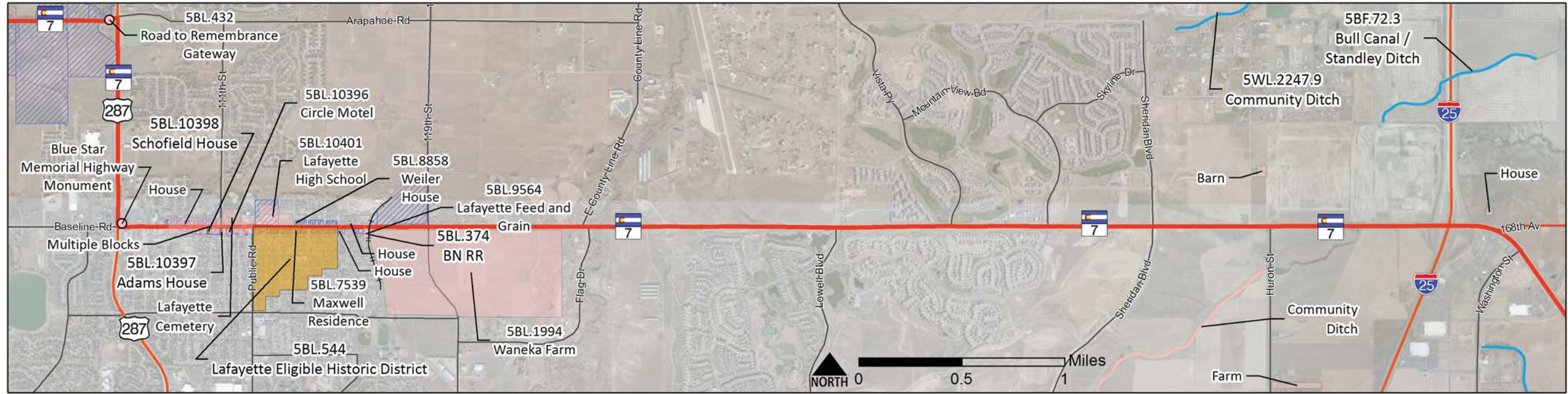
US-287 to I-25