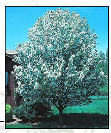
ORNAMENTAL TREES Example: Spring Snow Crabapple