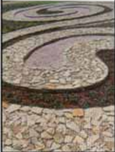
The letter-carved standing galls'n stone greets visitors of the garden's entry, above. The triple-spiral path, below, is made of gabbion mattress.