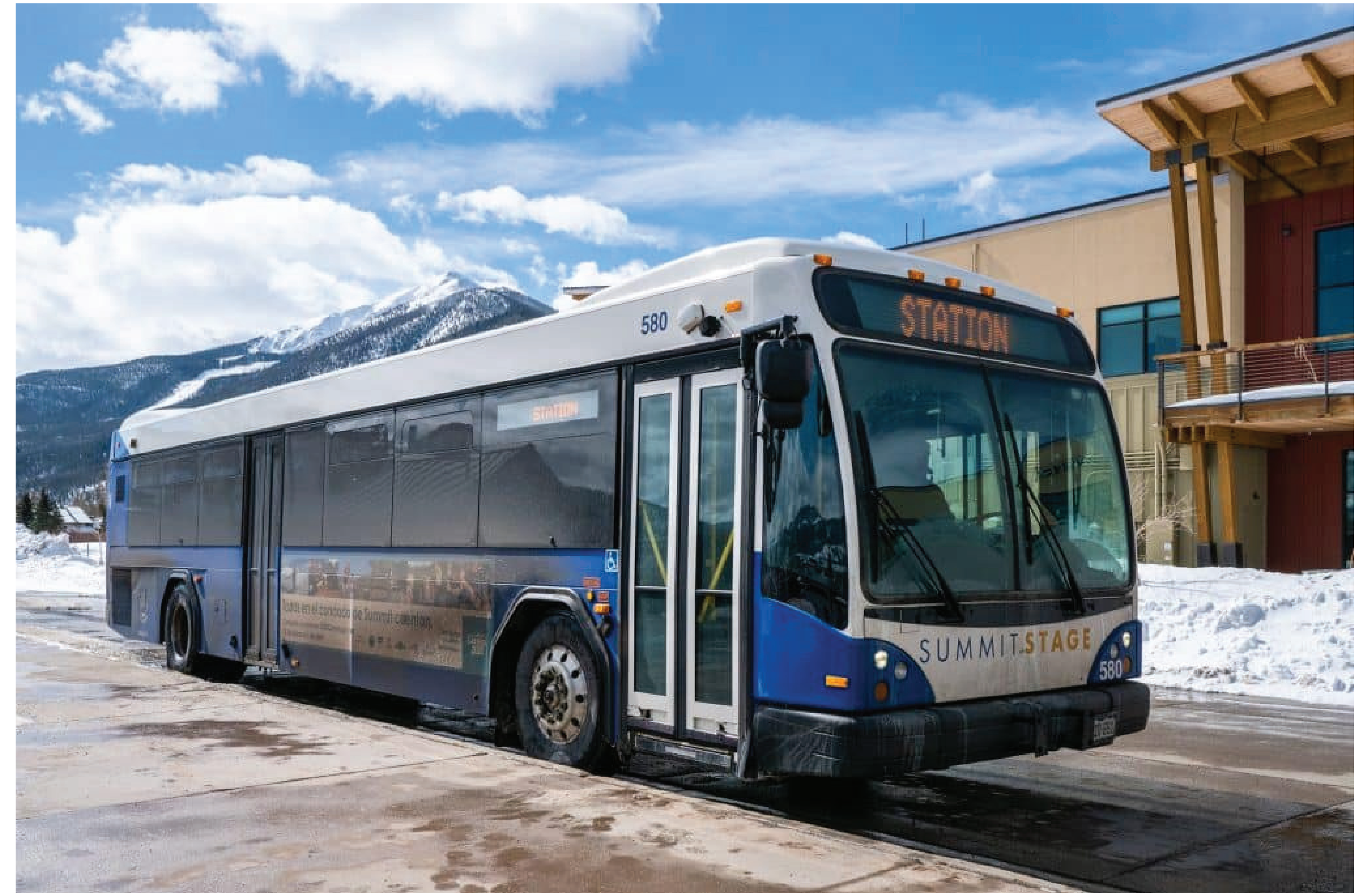
Summit Stage Bus