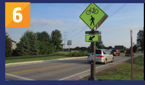
Lights Stop Flashing

Once the drivers have stopped their cars, it's your turn to cross. Look both ways, when the road is clear, and all the cars have stopped, you can confidently cross the street.