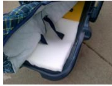
Craft store foam added to second hand seat-parents felt the seat was too hard under the baby's bottom.