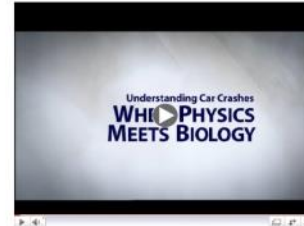
Understanding Car Crashes: When Physics Meets Biology