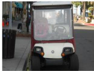
Car Seat installed in golf cart. Catalina CA