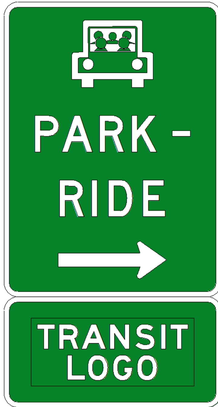
Figure 2 - Sign D4-2 with Supplemental Plaque