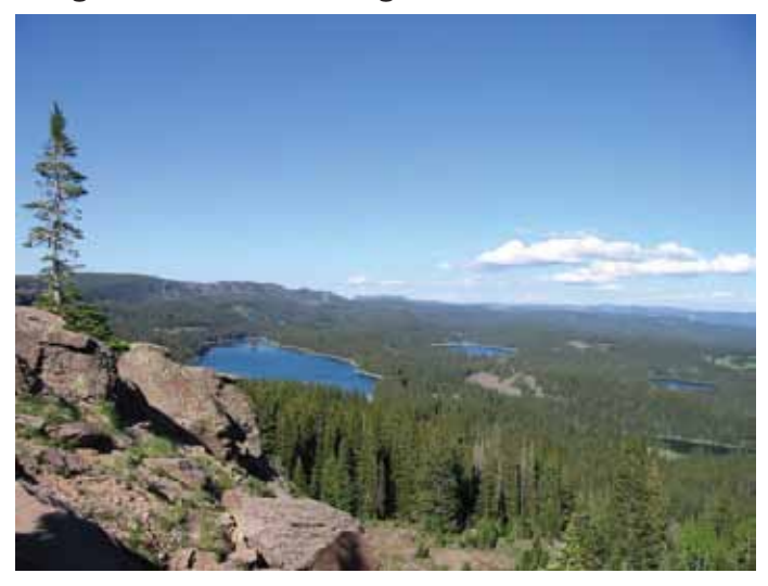
Grand Mesa National Forest Designated a National Scenic Byway Lands End Overlook Land 'O Lakes

Length: 63 miles. Driving time: 2 hours.