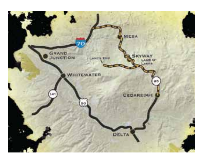
From I-70, the Byway climbs through the picturesque canyon of Plateau Creek to cool evergreen forests 11,000 feet above sea level. Moose, mountain lions, coyotes, red fox, elk, and deer thrive here, and more than 300 stream-fed lakes swarm with rainbow, cutthroat, and brook trout.